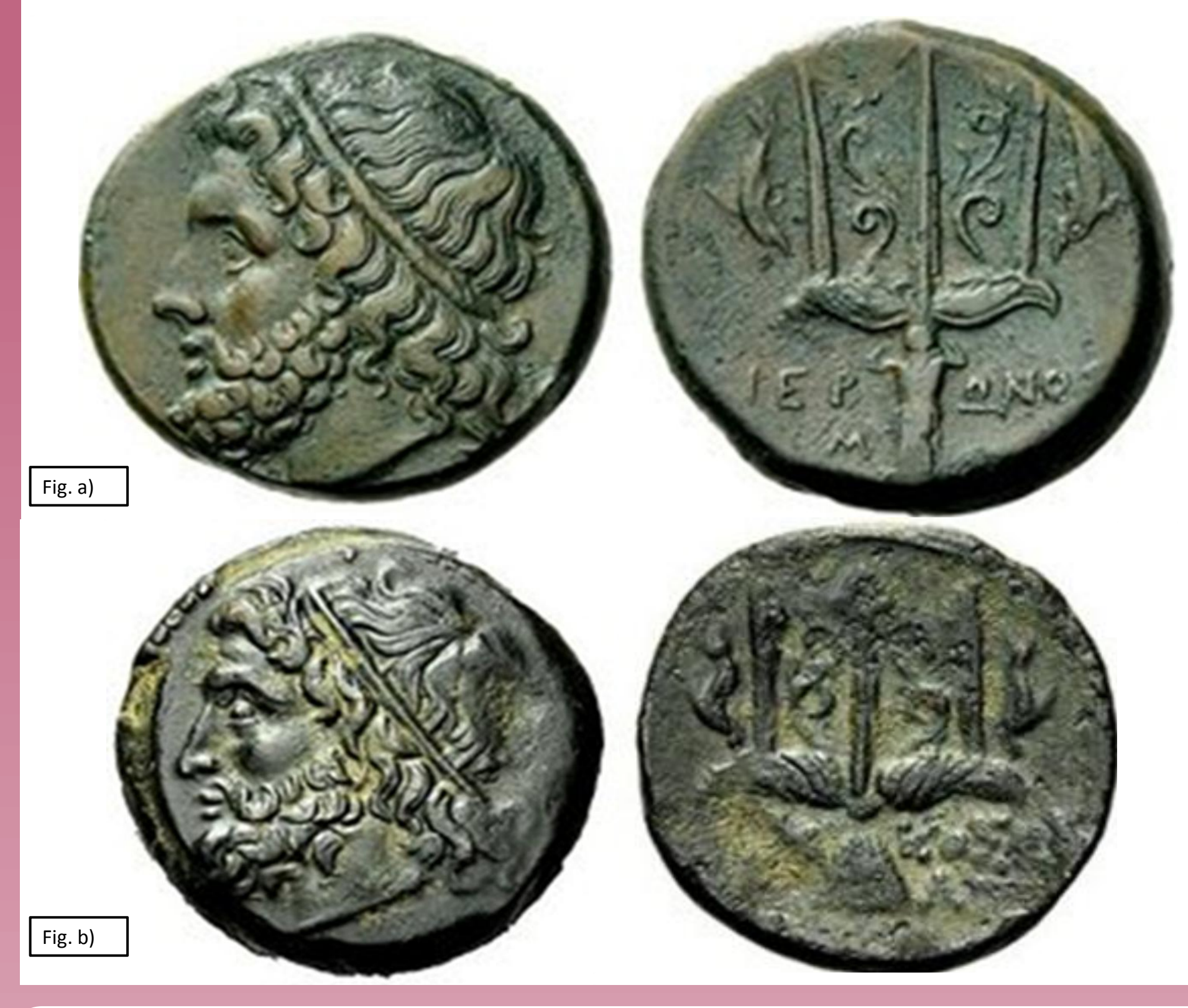
Fig. a is dated to c. 269/64-240, Fig. b was made later, probably c. 240-215 BC.

The reduction of the weight in Series B is combined with a substantial adjunction of lead as shown by recent research. Lead is not only less expensive than copper, but also lowers the melting point. Both made the coin production less expensive. If the coins' face value was the same as before, the state made considerable profit. This is to be explained as a consequence of the First Punic War (264-241 BC) which opposed Rome and Carthage. Hieron II of Syracuse was on the Roman side. The decrease of the weight and the addition of lead are part of the tentative to meet the financial problems caused by the war.