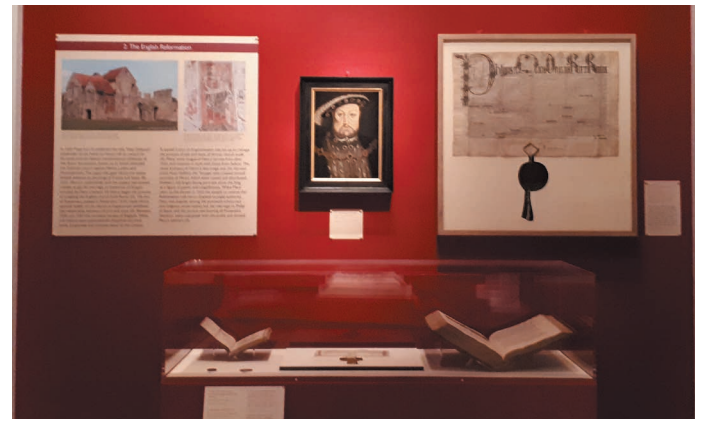
The 500 coins and medals on display are complemented by miniatures, books, drawings, paintings and other material

shows how coins and medals enhanced the monarchs' public projection of their authority. Henry VII inaugurated the new era by adopting the profile style that had spread from Italy and by introducing England's first pound coin (the gold sovereign). Surprisingly, his son was at first content to continue using his father's image. That changed about the same time that Henry VIII began to brood upon the lawfulness of his first marriage; the king thereafter became the first monarch to age on his coinage. The Break with Rome put Henry on the defensive and increased his need for revenue. The great debasement of 1544 ensured that Henry's subjects, quite literally, remembered his reign as an age, not of gold, but of baser metal.