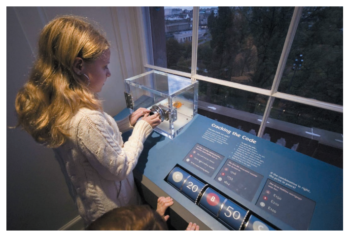
A visitor tries to crack the code and open the safe.

How about explaining how a safe works? Well, we use a nice, clear acrylic safe, filled with chocolate coins.