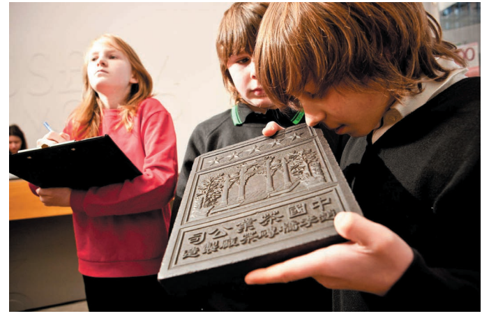
Tactile and sensory handling objects

Kids also get a free "Money Trail" activity book that guides them round the galleries, pointing out key features on money and para-numismatic material. But where we really go to town is with our school groups. When the Museum on the Mound opened in its current form in 2006, we had a modest expectation of welcoming 30 or 40 school classes per year. Working with a freelance education specialist, and directly with schools, we came up with a number of workshops that have proven very popular. So much so we average about 130 classes per year, many of which are repeat visits. These sessions are very much about teaching kids (and adults) soft skills about money - what it is, where it comes from, why we need it etc, rather than the more traditional financial education expected from the banking sector.