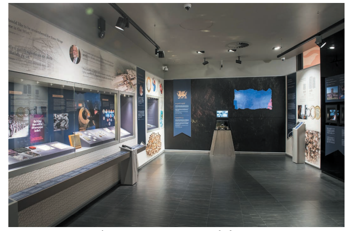
The new temporary exhibition