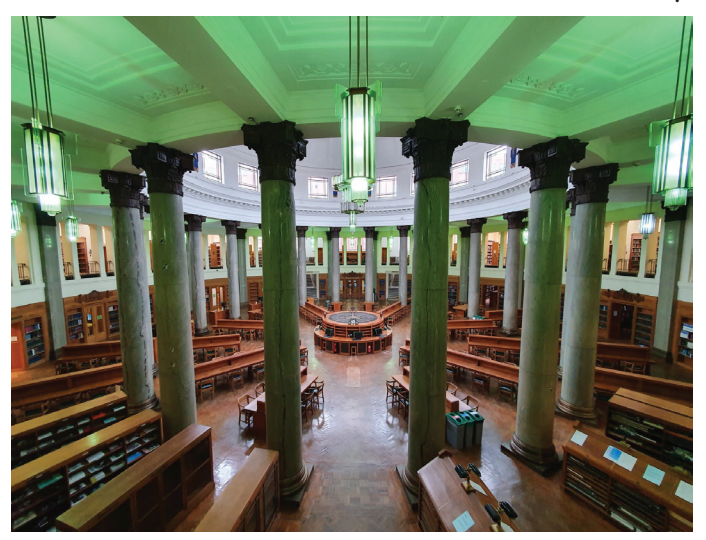
Main reading room at the Brotherton Library

The numismatics project was overseen by Dr Simon Glenn and came to an end in 2019. The project saw the development of an <u>online coin collection page</u> with specific numismatic fields and a <u>specialist</u> <u>search function</u> to allow users to perform targeted numismatic searches. With the assistance of a team of volunteers, it also resulted in the creation of catalogue records for over 6,000 coins, more than 2,000 with images. The unique opportunity presented by the coin collection was demonstrated to the University in a number of ways to justify its investment. The inclusion of coins in displays alongside other items from Special Collections in the Treasures of the Brotherton Gallery.