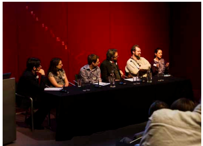
The discussion panel

The Money and Medals Network now extends across the length and breadth of the UK and a wide range of institutions with numismatic collections of all sizes and types form the membership. It was important that this variety be represented in the conference programme and I was very keen for regional museums to take the lead. This was an