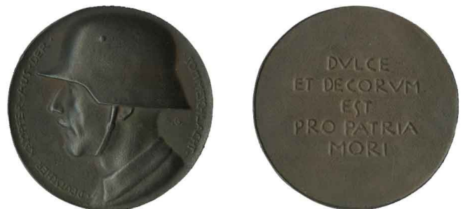
Somme Medal by A. Galambos

Lindl's work mixes medieval and modern themes by showing German soldiers dressed in old-fashioned armour. Their unrealistically long lances appear vulnerable against the huge sword-wielding figure of Death. Meanwhile, the central case in the display, designed to catch the eye of the passing visitor, features a German stahlhelm (steel helmet) on loan alongside a medal showing a German soldier wearing a similar helmet, commemorating the Battle of the Somme.