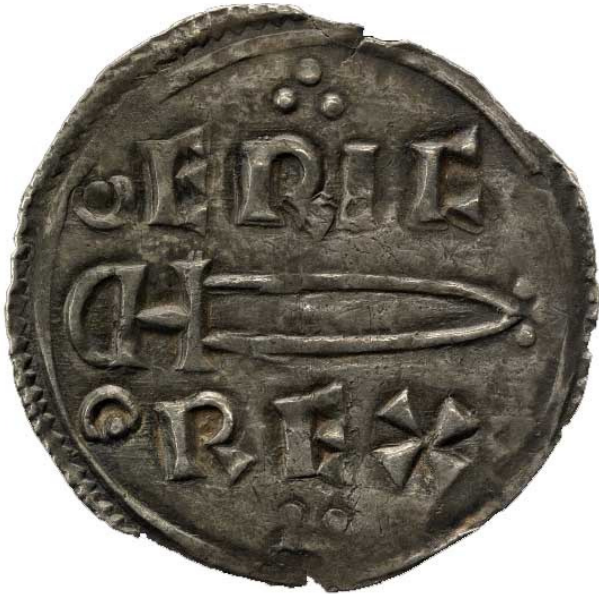
Coin of King Eirik Bloodaxe, minted in York 952-954 (© BM E.5081). On display in the exhibition Vikings: life and legend

Coins feature in a number of places in the exhibition Vikings: life and legend . Coins minted by Viking kings such as Eirik Bloodaxe of Northumbria, Harald Bluetooth of Denmark and Cnut the Great are, of course, included and help to tell a story of increasing national unity, economic change and processes of Christianisation.