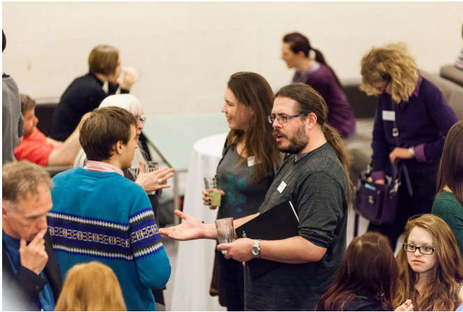
Delegates during a tea break

there were a few optional extras. Tours of the Citi Money Gallery were on offer for those interested in display, a storage workshop provided information for anyone interested in rehousing their numismatic collections and there was a chance to find out about funding opportunities from the Art Fund.