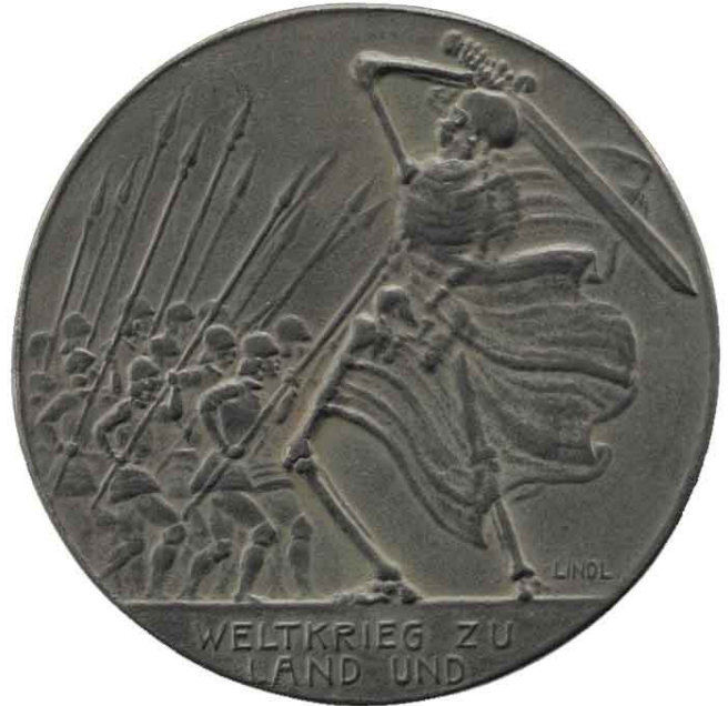
War on Land and Sea by Hans Lindl © Trustees of the British Museum

Three hunched figures, one clutching a kettle which is perhaps their sole remaining possession, flee the Russian invasion of East Prussia in September 1914. A number of German artists revived the medieval Dance of Death motif, in which skeletal figures indiscriminately drag the living to their demise. It was decided to make this a major theme of the exhibition and several medals, such as Hans Lindl's War on Land and Sea, were chosen with this in mind.