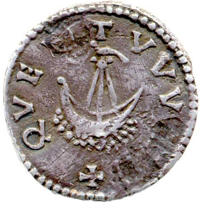
Silver denier of Charlemagne struck at Quentovic (812-14) showing ship with bird at masthead © Fitzwilliam Museum, Cambridge (MEC 749).

Fitzwilliam Museum, Octagon Gallery, 3rd June – 3rd August