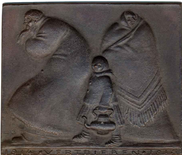
Refugees by Ludwig Gies

TH. Occupying ten cases in the Coins and Medals changing displays gallery (Room 69a), the exhibition groups the medals not chronologically but by such themes as war on land, war at sea and war at home. This latter section features some of the most poignant works, including Ludwig Gies' Refugees.