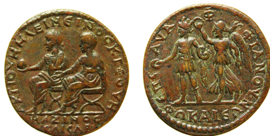
Bronze coin of Maximian and his son Maximus from Phocaea (Asia, western Turkey) AD 235-238