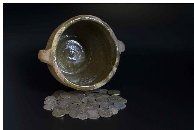
Middleham Hoard

Moving forward in time, the Civil War was perhaps the final great event which heralded the burial of many coin hoards. The collections of York Museums Trust boasts five hoards from the Civil War period but many hundreds have been found across the country. The scale of the hidden wealth is suggestive of the dislocation caused by years of warfare, and the high number of casualties unable to return for their wealth. Sizable hoards from Breckenbrough and Middleham show the amount of wealth that was left buried in the ground.