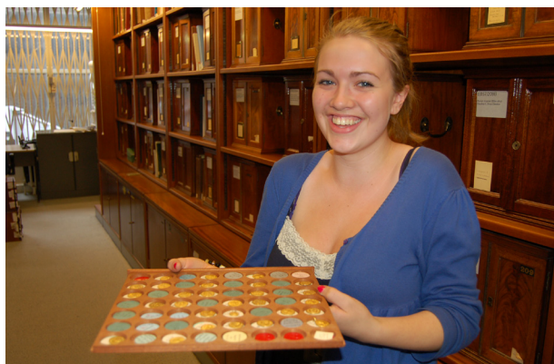
PAS volunteer at the British Museum