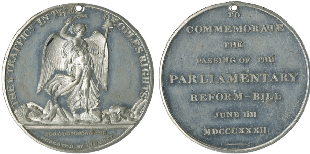
The Reform Bill, 1832