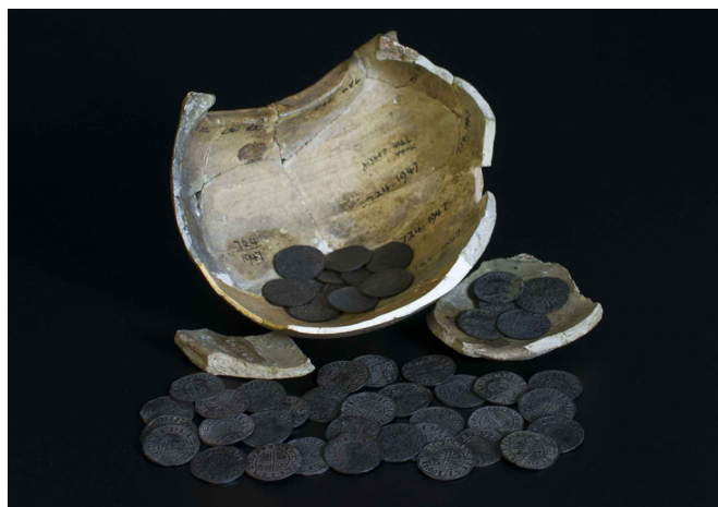
Bishophill Hoard

the Conqueror's 'Harrying of the North' may well provide the context for the deposit of the Bishophill hoard of silver pennies.