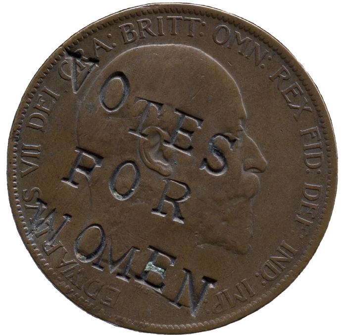
The Suffragette penny

An ordinary British penny of Edward VII was made extraordinary by a simple act of vandalism. Stamped in crude lettering across the head of the king is the phrase 'VOTES FOR WOMEN', the slogan of the suffragette movement. The deliberate targeting of the king, as constitutional monarch and head of the Church of England, could be likened to iconoclasm, a direct assault on the male authority figures that were perceived to be upholding the laws of the country. As Neil MacGregor wrote in A History of the World in 100 objects , 'this coin stands for all those who fought for the right to vote.'