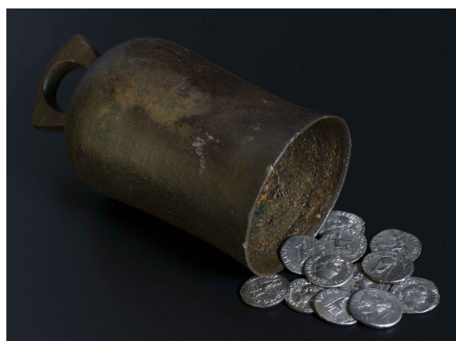
Binnington Carr Hoard

The exhibition begins in pre-history, highlighting the burial of wealth in a period before coinage. A spectacular Bronze Age axe hoard from Westow shows that it is not just coins which are recovered from hoards. The transformational arrival of the Romans to Yorkshire is visible from their hoards. A small hoard