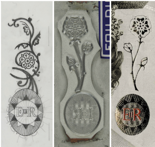
Rose foil detail

We are also fortunate to be able to display the reconstructed 'studio' of the Bank's engraver Allan Lye, alongside photographs of Lye working on intaglio plates for the Series C notes in the 1960s.