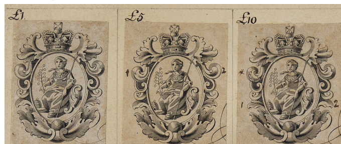
Three Britannia vignettes for the £1, £5 and £10

glance. A closer look reveals minute differences between the vignettes used for different denominations, a fact that could be easily overlooked by a counterfeiter making copies of multiple denominations.