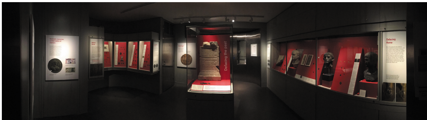
Panoramic view of the exhibition