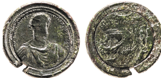
Bronze medallion of Commodus set in a wider rim, showing his facing bust, whose face has been erased; Rome, AD 191.

rulers whose statues were defaced, to modern politicians in Iraq and Libya - whose personages have been attacked through their images and names, a context helpfully displayed through coins, photographs and sculpture.