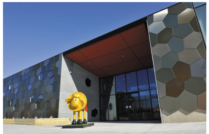
Entrance to the new visitor centre

The multi-million pound project is comprised of a factory experience, exhibition area, education space, café and retail shop. Visitors are given a guided tour of the circulating coin factory, where all the coins for the United Kingdom and many countries around the world are manufactured. They can witness, first-hand, the sights and sounds of thousands of freshly struck coins tumble from coining presses at the rate of around 750 a minute. As part of the tour visitors have the opportunity to have a photograph taken next to stillages full of coins, as well as a chance to 'strike your own coin', which is proving to be hugely popular with children and adults alike. On finishing the factory experience visitors are brought back into the main building to a large free-flow exhibition area where 1,100 years of the Royal Mint's history can be explored through a mixture of Museum objects and interactive displays.