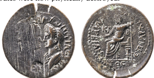
Bronze coin of Domitian and his wife Domitia from which face of the emperor has been erased; Cibyra (Turkey), c. AD 93-96.