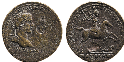
Bronze coin of Caracalla and Geta (erased); Mytilene (Turkey), AD 209-211/212.

An exceptionally well-produced exhibition, Defacing the past demonstrates the central place of visual media in the articulation of complex socio-political disputes, challenging the viewer to think about how image and text act not only to construct and reinforce power relations but also provide the means through which they might be dismantled. Displaying coins alongside conventional 'high art' objects emphasises their coexistence in a wider material and visual culture, and stressing the importance of numismatic evidence underlines the value of a source so frequently dismissed as boring and mundane in wider academic and museum contexts. A companion book published by the British Museum and Spink provides further context to the exhibition. Both are warmly recommended.