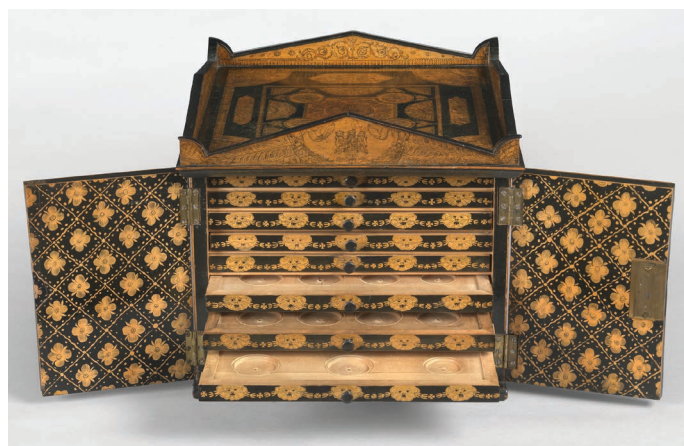
The Argyll Coin Cabinet – interior