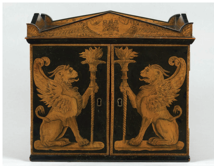
The Argyll Coin Cabinet – front

The doors are guarded by a pair of magnificent griffons facing each other. The Argyll arms are in the centre of the pediments on each of the four sides. The back is signed M.L. Pinxit but this person remains unknown though may have been a member of the duke's family. The cabinet may thus have been produced at Inverary Castle.