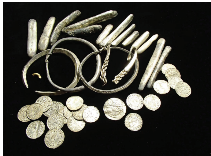
Watlington Hoard of silver coins, ingots and jewellery

On the list was also the Abergavenny Hoard, which is the earliest Norman Hoard from Wales, containing 199 coins of Edward the Confessor and William I, and the Hackney Hoard of American gold dollars, buried for safekeeping by German Jews during World War II. Important non-coin finds included the Ringlemere gold cup, perhaps used a ceremonial drinking vessel in the Bronze Age. The remarkable Downpatrick bulla, also of Bronze Age date was also on the list, as was the famous Staffordshire Hoard of gold and silver war-gear, representing the largest Anglo-Saxon hoard ever discovered. Also a silver boar badge from the site of the Battle of Bosworth, associated with Richard III. Put to a public vote Telegraph readers decided that the Frome Hoard, of over 53,000 Roman coins buried in a single vessel, eclipsed the others in terms of archaeological significance.