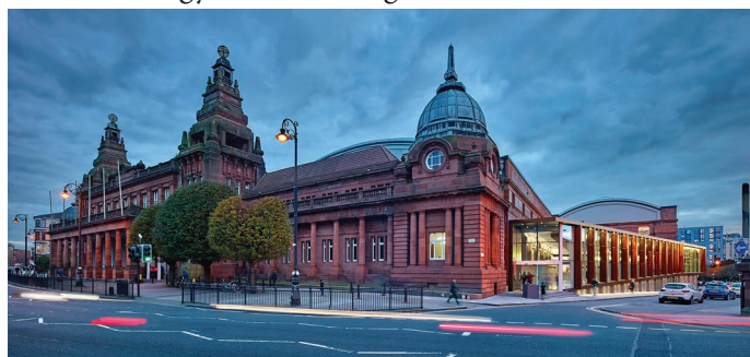
Kelvin Hall 2016

The move of the Hunter Coin Cabinet to the new Hunterian Collections Study Centre at Kelvin Hall is at last complete and we are now operating normally again. Apart from the Reception Desk number being changed to 0141 3302303, other telephone numbers, email addresses and mailing address remain the same. The address of the Hunterian Collections Study Centre is The Hunterian, Level 3, Kelvin Hall, 1445 Argyle Street, Glasgow G3 8AW.