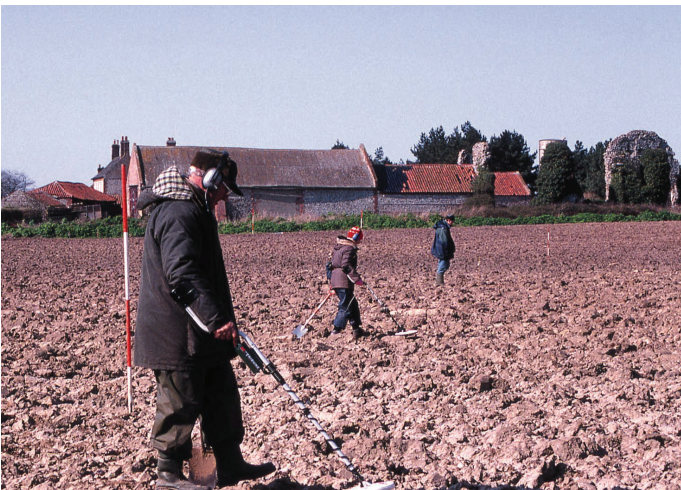
Detecting at Bromholm, Norfolk.