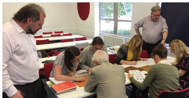
The West Midlands network engaging with medieval coins during a handling session

Both events proved to be very successful and well attended, and the rest of the year's training schedule is shaping up well. Future plans include an event on medals in York on the 25th of September, Stage 2 MMN events in Inverness and Edinburgh on the 5th and 6th of October respectively, a Stage 1 event in Leeds on the 27th of October and a debut event for the North East at the Discovery Museum in Newcastle-upon-Tyne on the 8th of November. Full details for all these events will be available on the Money and Medals website and circulated via the usual channels very soon.