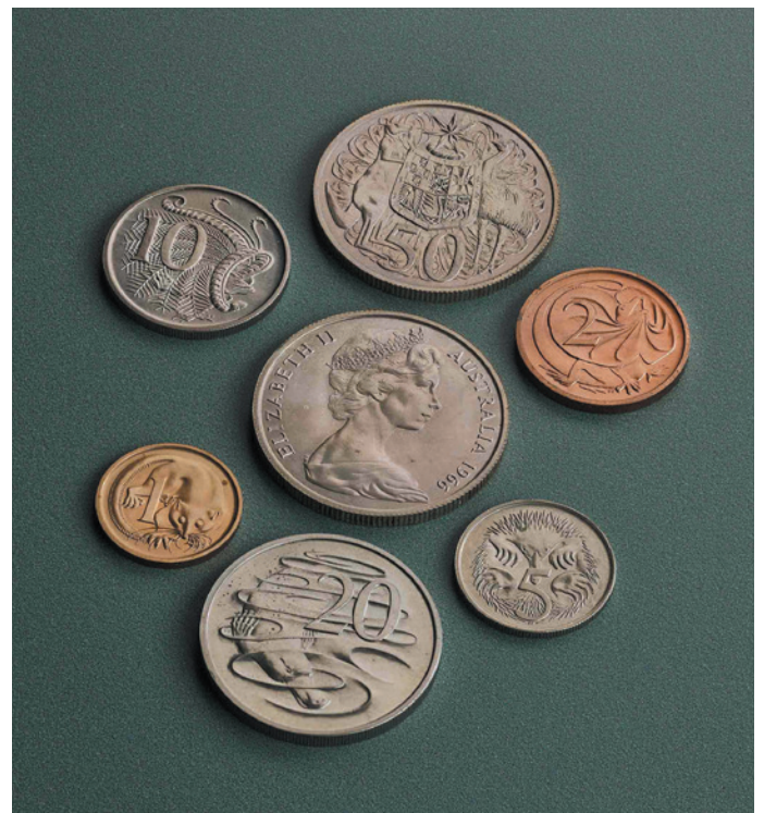
Figure 5. Australia's decimal coins of 1966

Australia was one such country. Its rich, distinctive wildlife provided the perfect subject matter, and the country's decimalisation programme in 1966 presented the perfect opportunity to design a full suite of coin designs on the subject. Silversmith Stuart Devlin was Metcalfe's spiritual successor, adding a