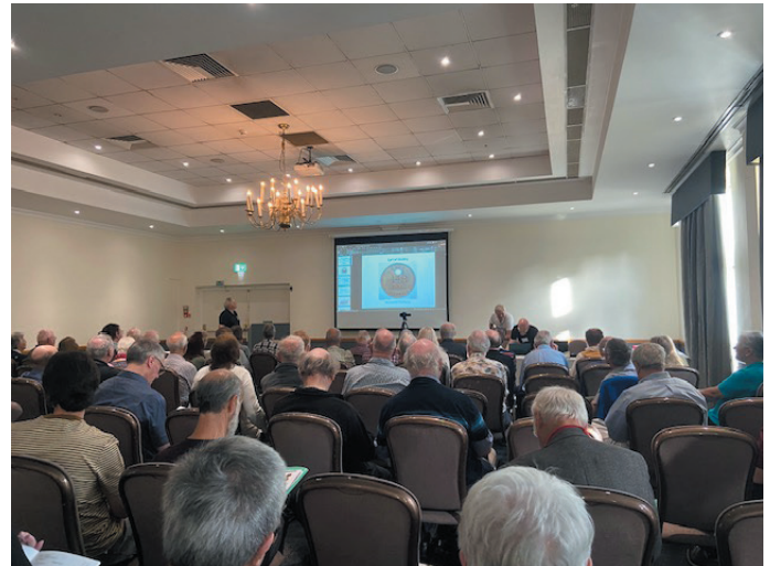
Photo of the lecture theatre at the 2023 Congress.