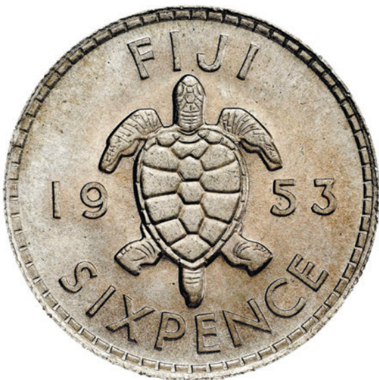
Figure 4. Fiji sixpence of 1953

modern aesthetic to the designs and impressing the judges with the way he was able to inject a sense of movement into his modelling of the animals. Devlin felt that the designs represented a more sophisticated and grown-up nation that distanced itself from the 'national advertising' of previous designs. Instead, he aimed for it to be a 'reflection' of Australia's 'cultural spirit' (Figure 5).