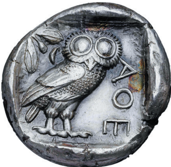
Figure 1. Athenian silver tetradrachm

Ancient coin designers captured the natural world in all its glory, and it was the Greek city states that perhaps did it best. Whether they featured symbols of the gods, such as the owl associated with Athena, a goddess of war, handicraft and practical reason, or native animals of a region, as displayed on the coins of Eretria or Akragas, these vivid and beautifully executed works of art are instantly recognisable. Such forms, and the skill necessary to execute them, largely disappeared from the canon of coinage design after the end of the Roman era, and it was not until the Irish Free State coinage in the 1920s that the same spirit of these early Greek pieces was recaptured (Figure 1).