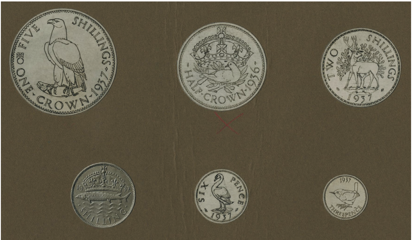
Figure 3 . Harold Wilson Parker's designs for the United Kingdom coinage

and far between on British coinage in the decades that followed, but other countries embraced the use of native animals and flora. The distinctive and iconic appearance of some of these animals, such as caribou from Canada or the turtles found in the waters of Fiji, lent themselves to become part of strong, aesthetically pleasing designs that could instantly be associated with their country of origin (Figure 4).