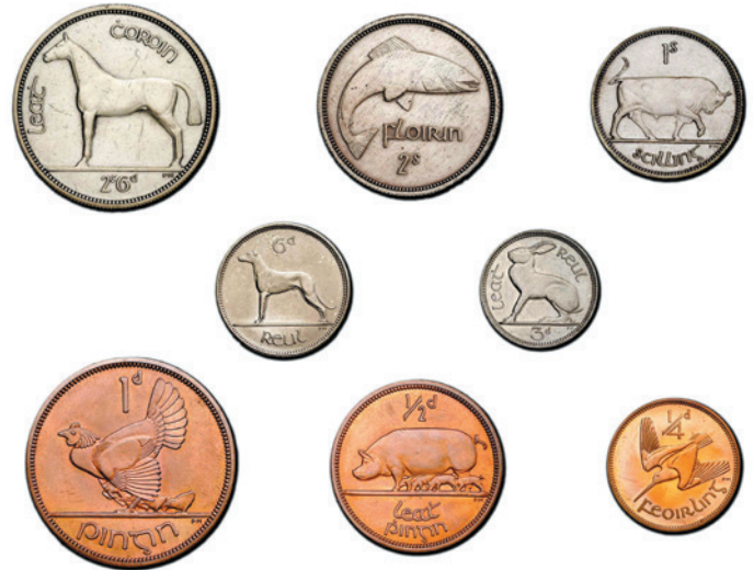
Figure 2. Irish Free State coinage