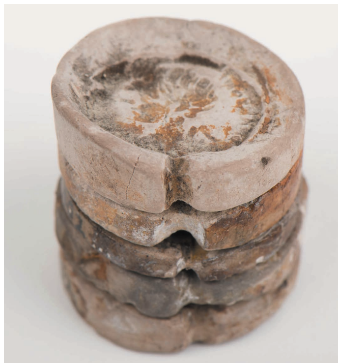
YORYM : H2402 Five Lingwell Gate coin moulds from the Yorkshire Museum collection.

surviving finds from the Lingwell Gate site into a shared resource, which will offer an overview of the phases of discovery, what is known about the site, and the methods of dispersal and acquisition into public and private collections. The project also aims to more closely identify the coins being copied, increasing our understanding of the assemblage as a whole and refining a date range for the production of the moulds. The new information uncovered will be shared with partner museums and will be incorporated into a number of online resources and public talks to share knowledge of this fascinating assemblage with a wide audience.