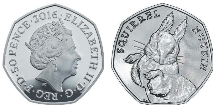
Elizabeth II fifty pence piece with Squirrel Nutkin reverse.

Squirrel Nutkin and friends sail to Owl Island. They offer gifts to Old Brown, the resident owl, and ask permission to collect nuts. Nutkin, however, impertinently dances about and sings silly riddles to Old Brown. This goes on for 6 days until Old Brown loses his temper and seizes Nutkin and tries to skin him alive. Nutkin escapes but not without losing most of his tail.