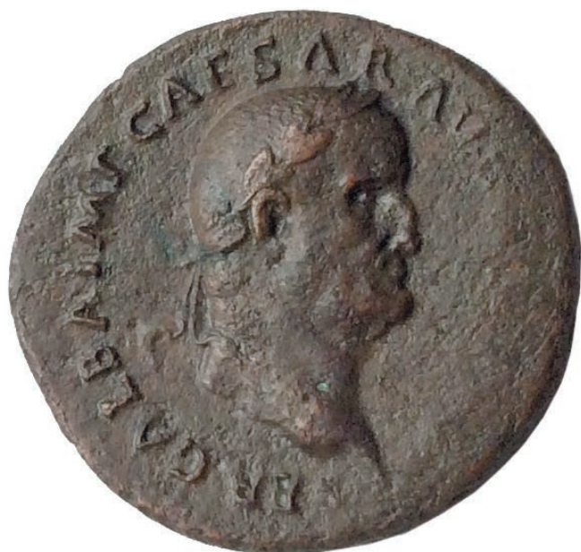
Obverse of Galba AE as

All items have now been ticketed and a detailed inventory drawn up. Unfortunately, no documentary evidence relating to coins has yet been found in the Derby archives. However, new channels of investigation are ongoing and these could well reveal clues to the origin, growth and ultimate discontinuance of this remarkable and challenging discovery.