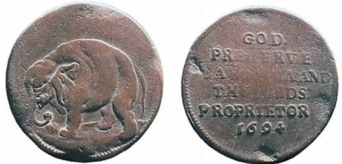
Obverse and reverse of 1694 Carolina jetton

and even a single Chinese 'cash' coin of Emperor Sheng Tsu (1662-1722). All but one of the Roman Imperial coins was base metal, the exception being a denarius of Domitian. The Roman Provincial and Byzantine were also base metal issues. European coins in the assemblage showed a strong bias towards Spain and the Spanish Netherlands, together with a number of re-valued copper Maravedis from various Spanish possessions. The smallest coin, and one of the few in silver, was a Russian 'wire money' denga or half kopek, in the usual extremely worn condition. On the other hand, the largest coins in the find were two Swedish copper ore dated 1640 and 1649, weighing just over 53 grammes each. This accumulation was surprising on two counts, firstly by what it did not contain and secondly by those coins which were unexpected. For example; there were five coins of the emperor Galba - but only one crude provincial copy of an as of Claudius. Likewise, there was a Siege of Limerick farthing - but no examples of the more common 'gunmoney'. Most of the ancient coins were badly worn, especially the later radiates and House of Constantine issues, which displayed all the hallmarks of random field finds. A number of the coins rank as important pieces and one unexpected item in particular stood out from the group of later miscellanea. This was a Carolina 'Elephant' jetton of 1694 (reported in Money & Medals December 2016). An extremely rare piece in any condition.