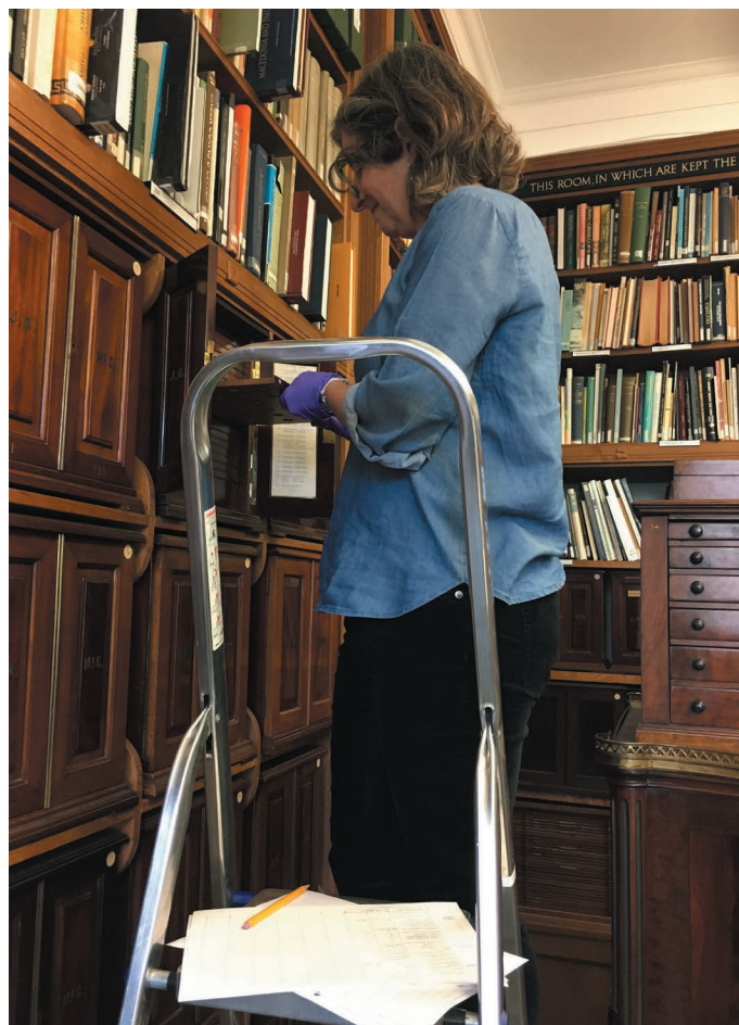
Surveying the McClean Collection of Greek coins

Conservation concerns recorded for individual objects included: signs of instability (such as powdery corrosion on metals); structural concerns (for example breaks or cracks in coinage, or tears in the textile ribbons of medals), and surface concerns (such as the presence of grimy dirt, or heavy tarnishing, hampering visibility of surfaces).