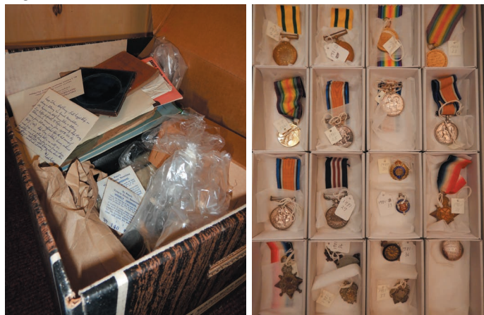
Parts of the Strommess collection: Before and after

This small project work has not only conserved and adequately stored our collections but will also facilitate wider access to the collections. The next step is to seek funding so that the collection can be fully catalogued and digitised.