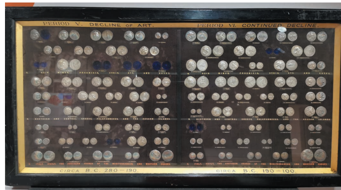
One of the electrotype frames from Folkestone Museum

It was also fantastic to find examples outside the UK.