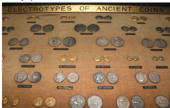
Frame of electrotypes from Shrewsbury Museum and Art Gallery

It was encouraging to see that so many sets were still present in collections throughout the UK. To briefly summarise some of the responses; the National Museum of Wales, Cardiff, Worcester Museum and the Towneley Hall Museum, Burnley reported sets of English Historical Medals. Not just one set but two of 2 frames of electrotypes of Ancient coins were reported from Shrewsbury Museum and Art Gallery, and most impressively Folkestone Museum had a complete original set which included 2 frames of gems and scarabs. Reports from memory added sightings from Liverpool University and Nottingham Castle Museum, and I was also assured that there were sets on display at Cliffe Castle, Bradford.