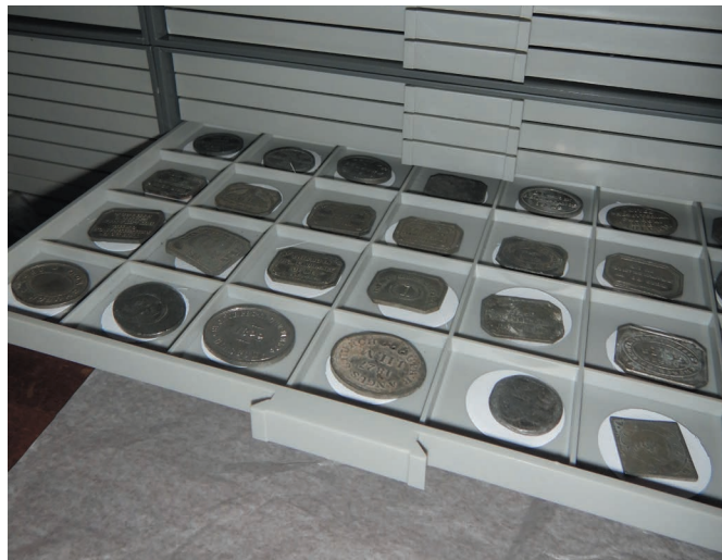
Some of the collection in new coin cabinets

It was quickly realised that appropriate storage and conservation of the collection was required to prevent further deterioration and damage. Unfortunately, this was out with the scope of the funded project. Such discoveries were unforeseen and not factored into the existing budget. Following the site visit, the MMN kindly supplied us with a coin storage case through funding from the Royal Numismatic Society, which enabled us to safely store some of the collection, but many coins and medals remained in the original box.