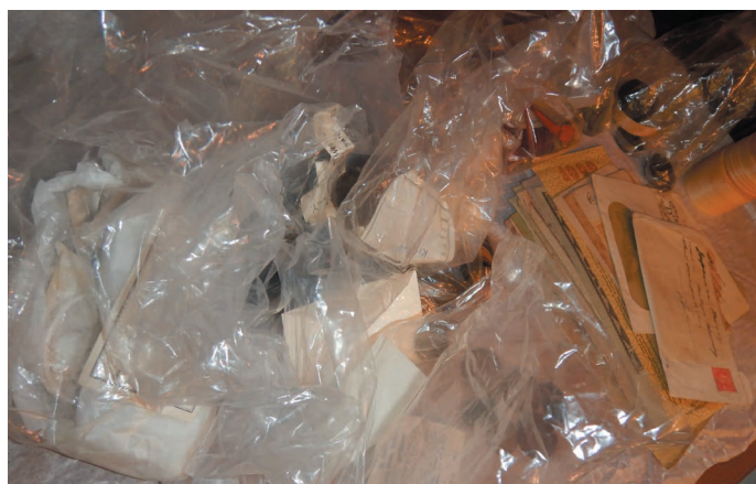
Example of the storage conditions recorded during the collection project

The Orkney Natural History Society (known as Stromness Museum) was founded in 1837 and holds the primary collections of natural history, maritime and ethnography for Orkney. We also care for collections including fine art, archaeology, and social history. In 2017 the museum employed paid professional curatorial staff for the first time in its history. One of the aims of the Collections Development Team Project was to conduct an inventory and audit of the collections.