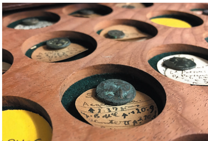
Coin requiring attention

In July 2019, I set out to undertake a Conservation Survey of the Coins and Medals collections of The Fitzwilliam Museum, University of Cambridge. Collections surveys are often employed in museums to identify and evaluate conservation treatment and preventive care needs for collections, and a carefully designed survey can provide invaluable data for formulating practical plans for embarking on conservation and collections care projects. Perhaps most vital, surveys also can provide the hard evidence needed to appeal to managers for provision of collections care resources.