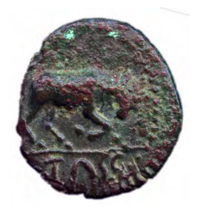
Bull butting, TASC(IOVANI FILIVS)