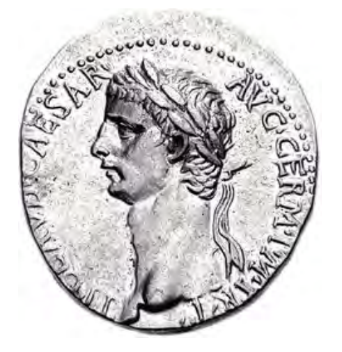
Head of Claudius with laurel wreath