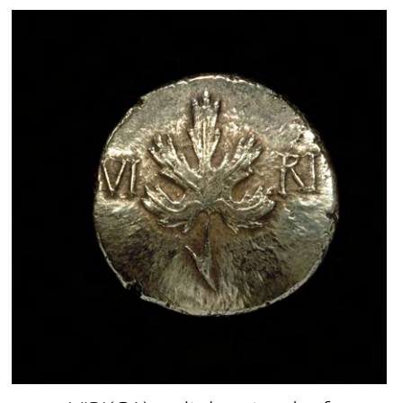
VIRI(CA), split by vine-leaf