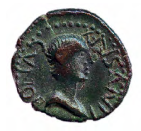
Head (perhaps intended for that of Cunobelinus.)