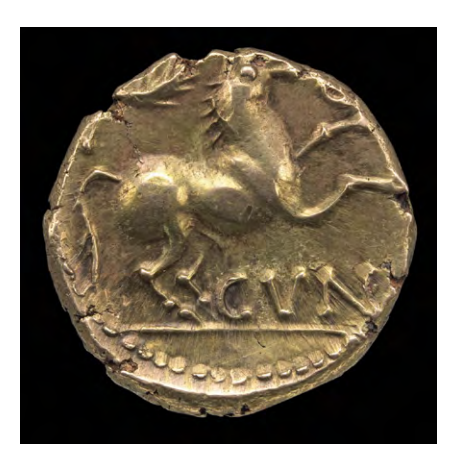
Horse, CVNO(BELINVS) British Museum 1977,0434.11