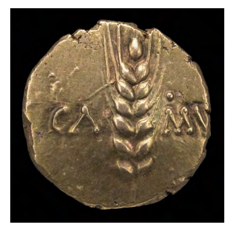
Ear of corn, CA and MV (LODVNVM)