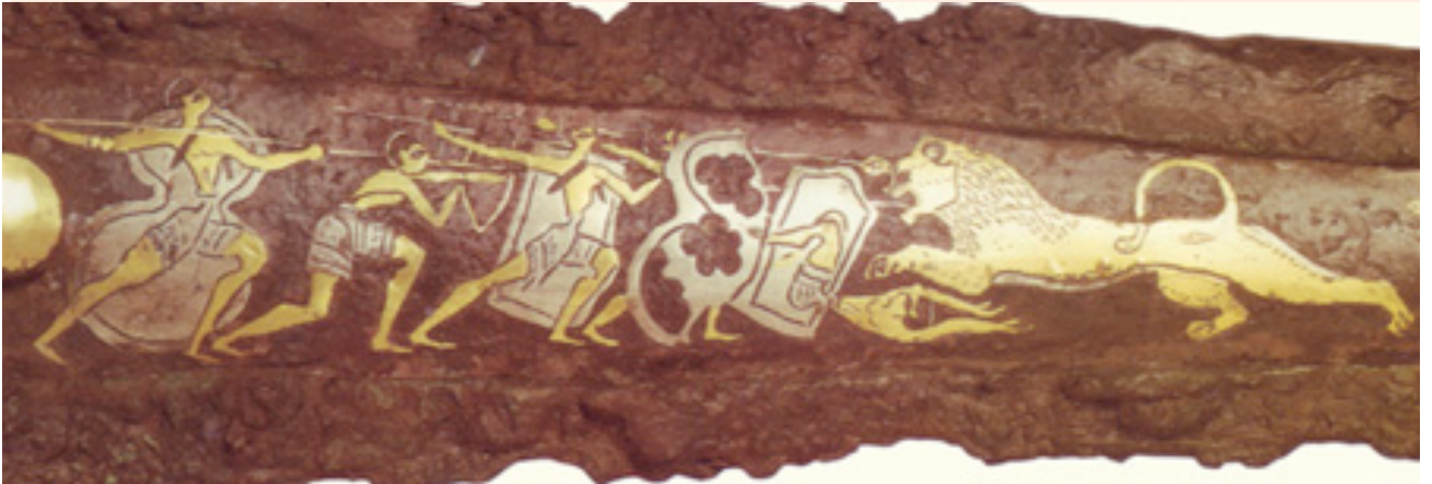
Dagger from a tomb of Mycenae