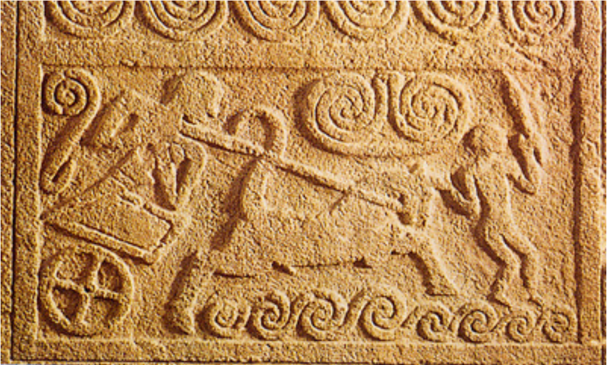
Royal Shaft-grave V in Mycenae (1500 BC)