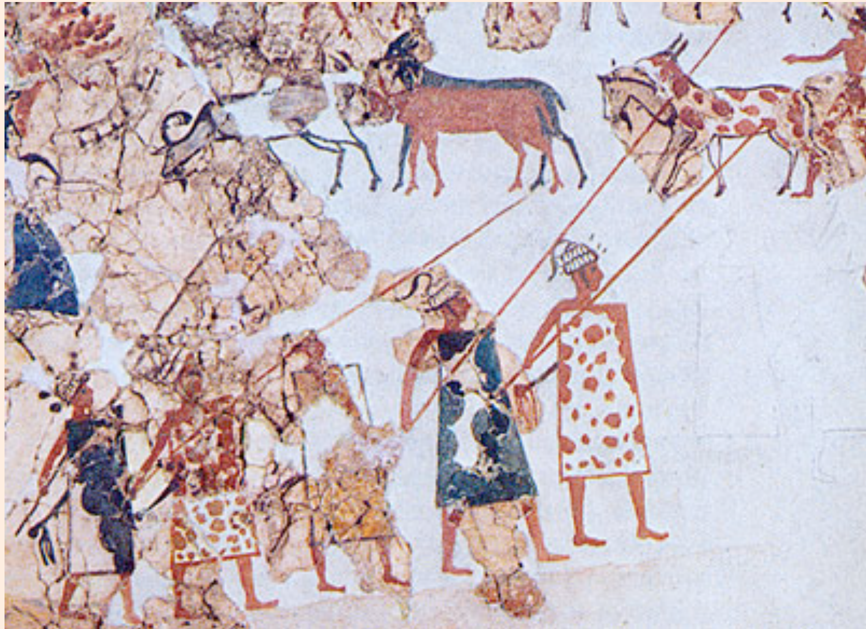
Fresco from Thera, Crete, XVII cent. BC