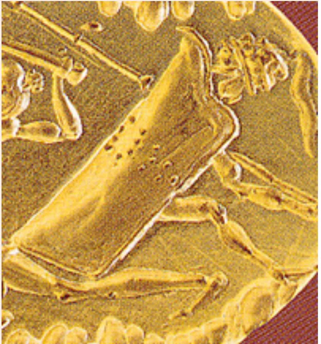
Golden ring from a tomb of Mycenae