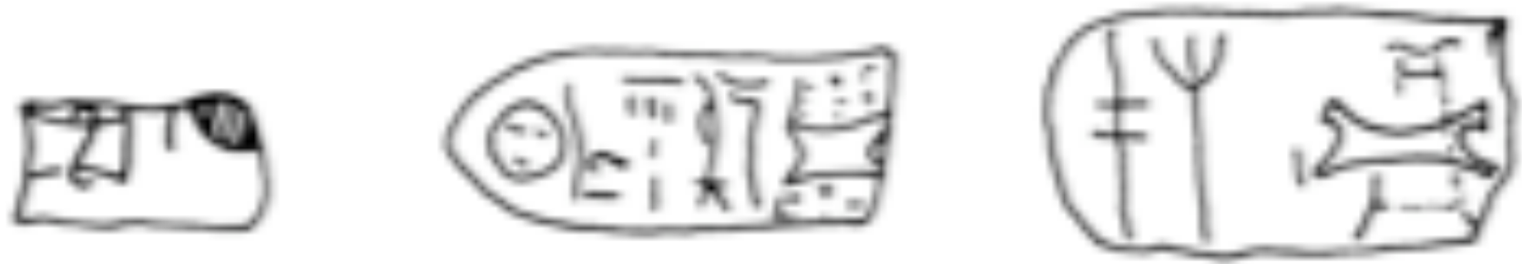
Tablet from Cnossos