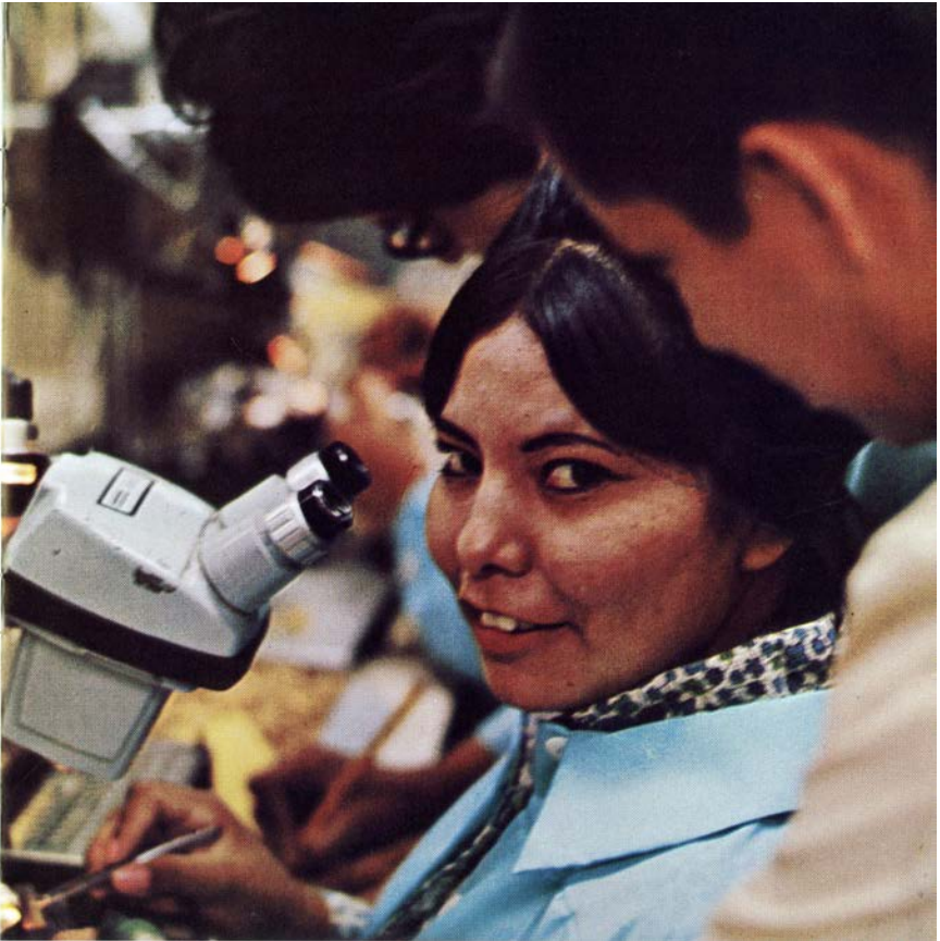
Figure 3. Shiprock Dedication Commemorative Brochure , September 6, [1969], lot X5184.2009, folder 102725169, Computer History Museum, Mountain View, CA.

fills the whole page (fig. 4). The resemblance between the pattern of the rug depicted on the first page and the circuit is striking and uncanny. It makes the visual argument that Indian rugs are merely a different material iteration of the same pattern or aesthetic tradition found within the integrated circuit. The opposing page states, “The blending of innate Navajo skill and Semiconductor’s precision assembly techniques has made the Shiprock plant one of Fairchild’s best facilities—not just in terms of production but in quality as well.”