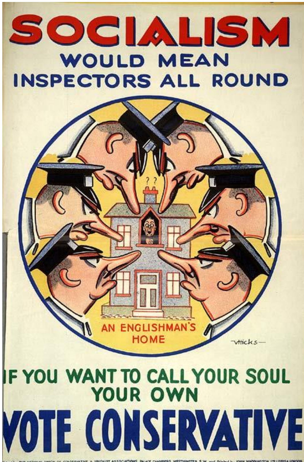
6. 1929 Conservative party propaganda poster.