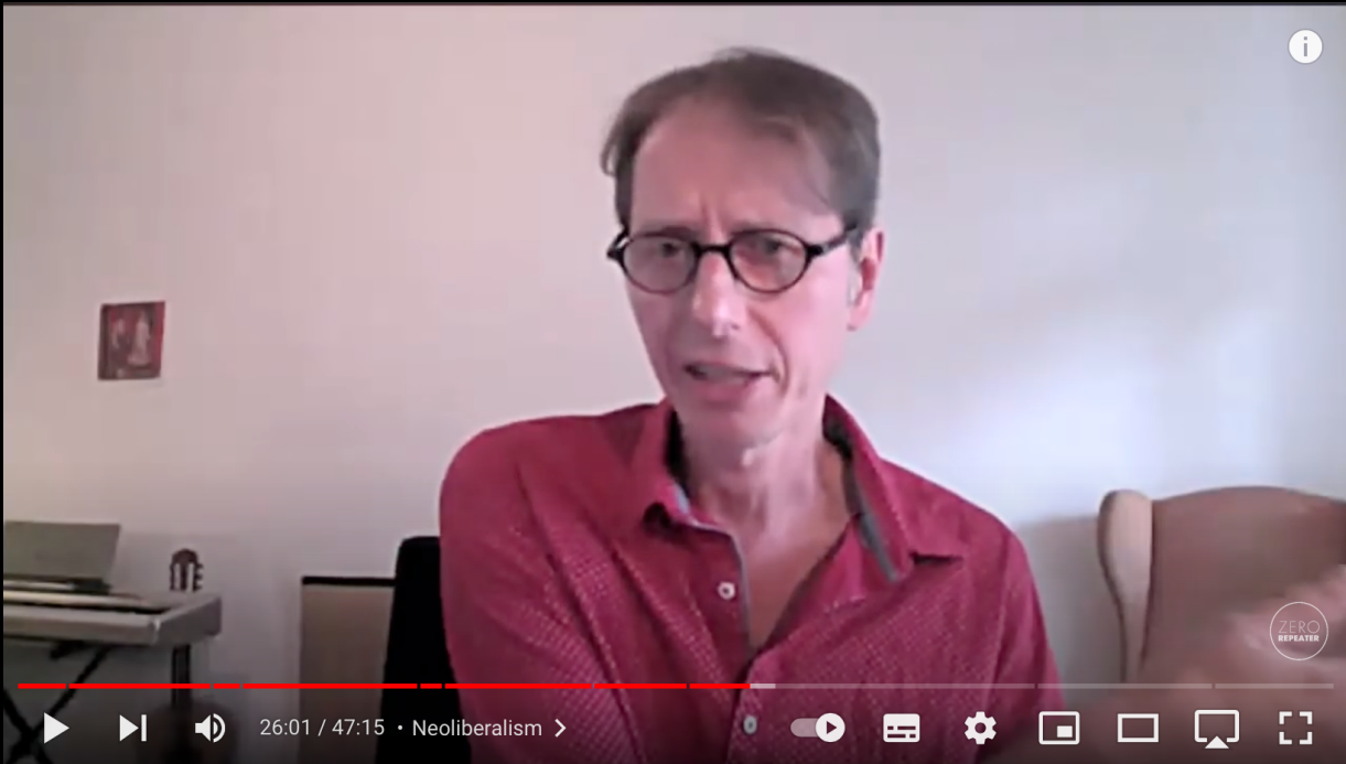
Vandana Shiva: End of the Megamachine: A Brief History of a Failing Civilization

"The topic could not be more important. A very valuable and surely timely contribution." Noam Chomsky