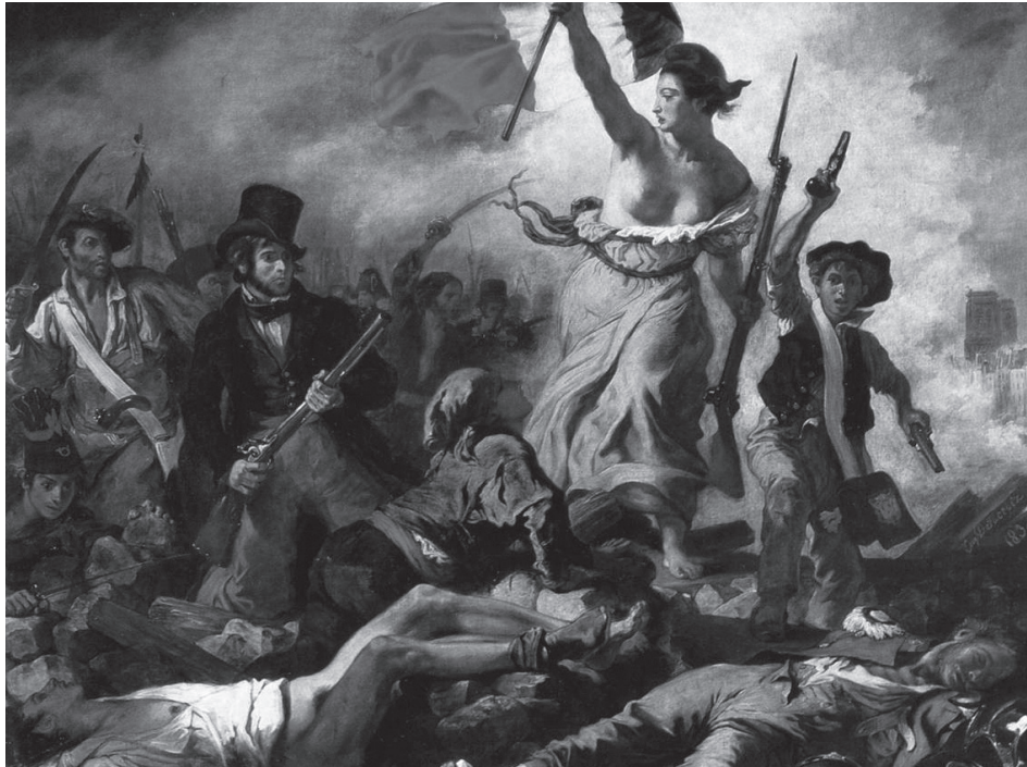
Eugène Delacroix, 'La Liberté guidant le peuple', 1830.

The following sections stage a conflict between the barricades and the boulevards, with a view to the performative nature of the barricades in their historical context: the ways in which the material configurations of barricades and boulevards produce certain kinds of perception; and how perception renders subjectivity.