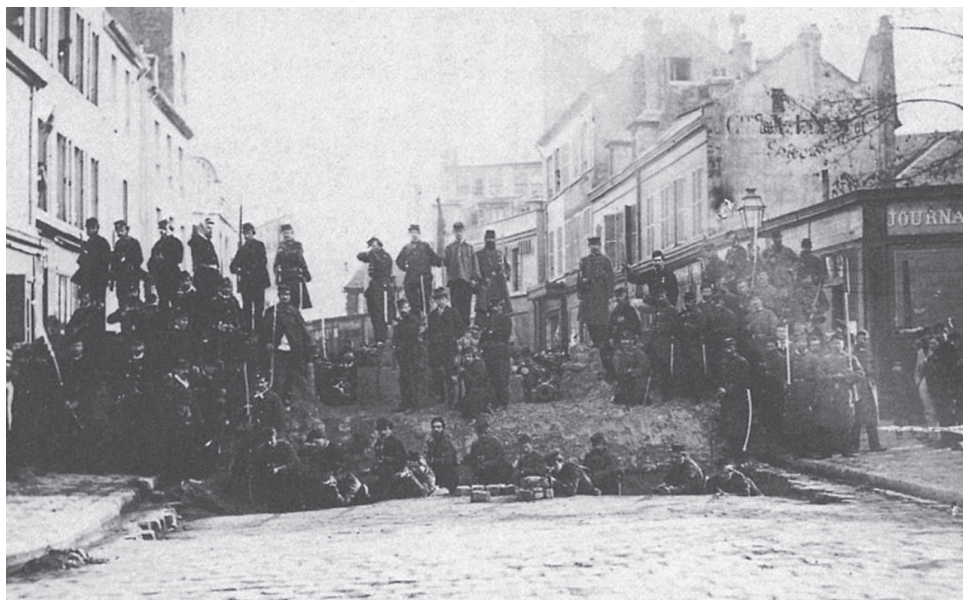
A barricade of the Paris Commune, on the rue des Amandiers, 1871.

Traugott consciously seeks to lift this ‘spell’, in order to reveal the production of social movements from collective actions. 7 He argues that barricading became, with each repetition, an increasingly ritualised act loaded with “symbolic and sociological functions” (1993: 317). Each new instance of barricading was also a re-enactment of previous barricades. During the Paris Commune, the Communards were eager to have themselves photographed with their barricades. In doing this, they reinforced the spectacular and performative nature of their constructions. 8