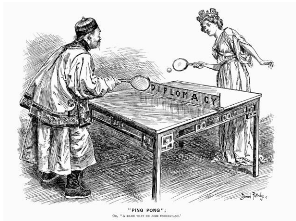
Edwardian Era Cartoons from Punch.