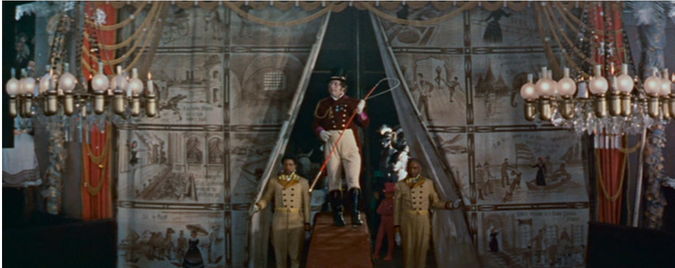
ABOVE The Ringmaster (Peter Ustinov) emerges, allowing a glimpse backstage.

Not truly blank, of course, as we see between the chandeliers the infrastructure of the circus: rafters, ropes, and pulleys; a lanky Uncle Sam conducting a blackface band; a make-shift proscenium arch with the Passion of Lola Montès drawn in caricature on a canvas curtain. When the Ringmaster emerges from behind this curtain, we glimpse various figures bustling about in front of a bare wall and scaffolding. As the remarkably fluid long take progresses, we see the film's construction, too. Cameraman Alain Douarino recalls that he had warned Ophuls about the plan to follow the Ringmaster's movements in a long take because he knew the camera's tracks would be visible in the shot. In his own words, 'Ophuls simply said, "I don't care"'. 1 In the film we can plainly see the results of a compromise: the tracks covered with rugs.