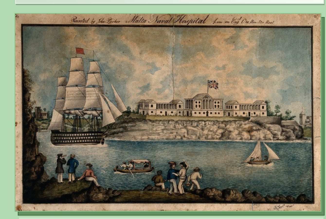
The Naval Hospital at Bighi Malta