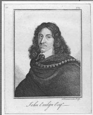
John Evelyn Commissioner for Sick and Hurt mariners and Prisoners of War, 1664-67 and 1672-74

The research undertaken during this fellowship will produce a series of case-studies on the treatment of sick and disabled servicemen, placing local and central responses to sick and injured men within broader attitudes towards disability and relief. I have gathered materials related to the relief of disabled veterans and on local responses to sick and injured seamen from 1650 to 1690. On the basis of this research I have written an article on casualty care in coastal communities during the Anglo-Dutch wars. I will next produce studies on the impact of casualty care during Anglo-Dutch wars on local efforts to relieve disabled veterans, and on casualty-care entrepreneurship along the coast during the Second Dutch War. Subsequent research will focus on the care of sick and wounded mariners during the 1690s and War of Spanish Succession.