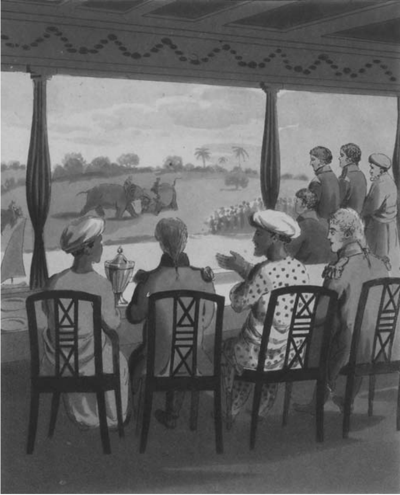
Fig. 1. 'Marquis Wellesley and his suite, at the nabob of Oude's breakfast table, viewing an elephant-fight', from Thomas Williamson, European in India, from a collection by Charles Doyley (London, 1813), Plate XX. By permission of the Syndics of Cambridge University Library.

By these means the author asserted the triviality of the elephant-fight and presented it as the amusement of an inferior mind. No explanation was given for the avid European interest depicted in the engraving. Does this illustration then exemplify a shared heritage or suggest constructions of difference?