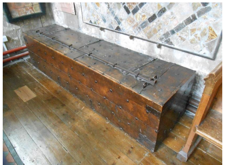
The 16thC chest in the parish church of St Peter, Winchcombe (Gloucestershire), used for the safe storage of communal documents and valuables.

Well-documented in a range of sources, the parish emerges as a social hub at the intersection of the secular and sacred spheres, where priorities and changes were negotiated between laity, clergy and, increasingly from around 1500, state authorities.