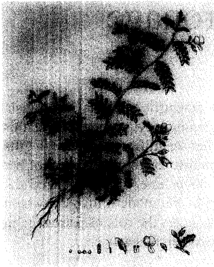
Figure 3 Smithia sensitiva . Engraving by J. Sowerby in W. Aiton's Hortus Kewensis , 1789.

long been dedicated to the sanctity of botanical language, distancing himself from the erotic terminology of authors such as Erasmus Darwin, whose botanical libertinism incurred anti-Jacobin criticism from the likes of Viscount Canning 15 . Goodenough counselled Smith on the art of purifying the Linnean system, which placed the reproductive parts of the plant at the centre of botanical study: 'your character for delicacy would not suffer by attending what I say about scrotiforme and genitalia ... Linnaeus's disgusting names, his nomenclatural wantonness, vulgar lasciviousness, and the gross prurience of his mind'. Smith, who had made gifts of his works to the Duchess of Portland, took steps to avoid compromising relations with female readers. As he wrote in his Introduction to Physiological Botany :