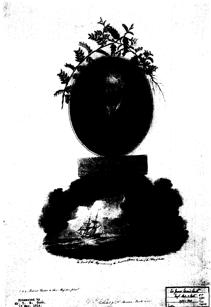
Figure 1 Engraving of J.E. Smith by W. Ridley after John Russell's pastel in W. Thornton's (1799) Philosophy Of Botany .

The purchase of the collections thus had the potential to make Smith a person of national importance – a patriot, who had won a great treasure for England, and assisted in securing victory in the race between nations for possession of nature. Such at least is the message of the illustration in Thornton's New Illustration Of The Sexual System Of Linnaeus (Figure 1), a lavish series of folios published during the period of the Napoleonic wars. Smith appears crowned by the plant, native to Hindostan, that carries his name, Smithia sensitiva , while beneath him race the English ship, bearing the Linnean legacy, pursued by a Swedish vessel, dispatched too late by King Adolfus, who was allegedly out of the country when the great collections were offered for sale. The print manufactured the Banksian voyage that Smith never undertook: a passing of the natural historical crown to Britain. It also effected the translation of the collections from private investment to public property.