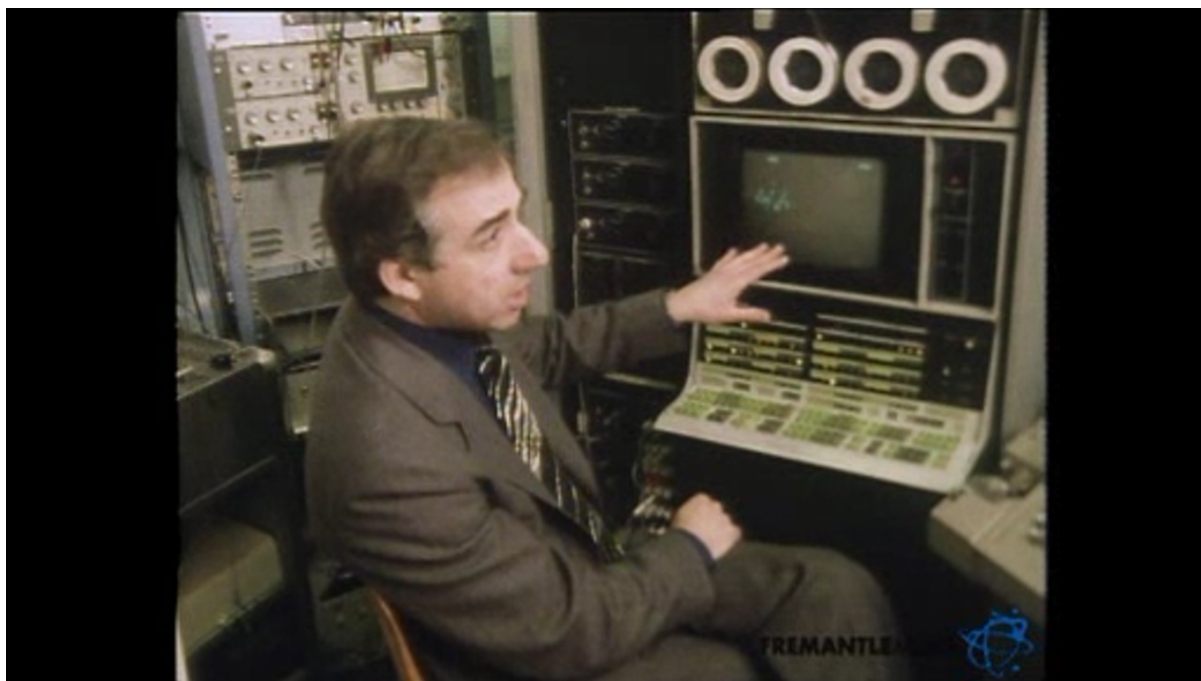
Screenshot from TV EYE , 'Tranquillisers – The Second Warning', 21 February 1980 73