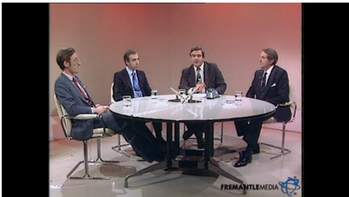
Screenshot from TV EYE , 'Tranquillisers – The Second Warning', 27 March 1980 75