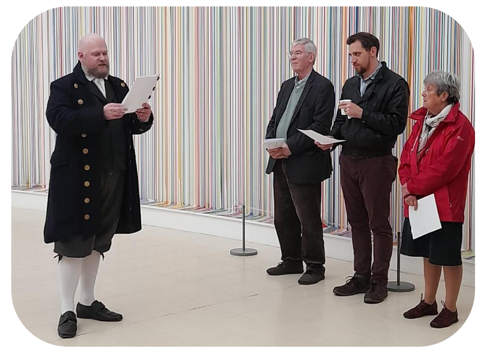
Performative elements in our papers on homilies & parochial tyranny: ©BK

assemblage and indirect approaches. In the end, the actors managed to improvise upon traditions and use the absence of certain images and audiences as a frame for their performance.