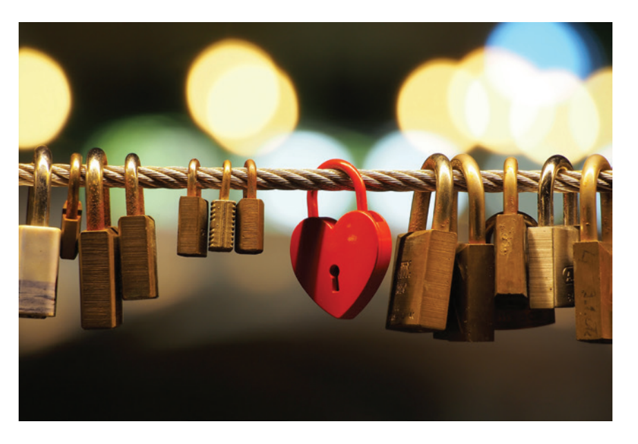
Love-locks on Butchers' Bridge in Ljubljana, Slovenia.

In our modern era, it is clear that the nature of 'objecthood' is undergoing great change: 'virtual reality' and the rise of virtual museums, online collections, 3D printing, and sensory simulation ensure that objecthood - and our relationship with it - is as relevant as ever. Amidst the evolving status of objecthood, do we continue to create 'apotropaia'? If so, where might we identify them? How might we extend such a concept to scientific, medical or technological 'objects', if at all? In embracing the latest developments in Post-Colonialism as well as Neuroarchaeology and Phenomenology, this conference explored whether or not we are in a position to say something more about such objects, our interaction with them, and our ideological approach to them. Following the success of the conference, an edited volume with Warwick Series in the Humanities, in partnership with Routledge, is being pursued