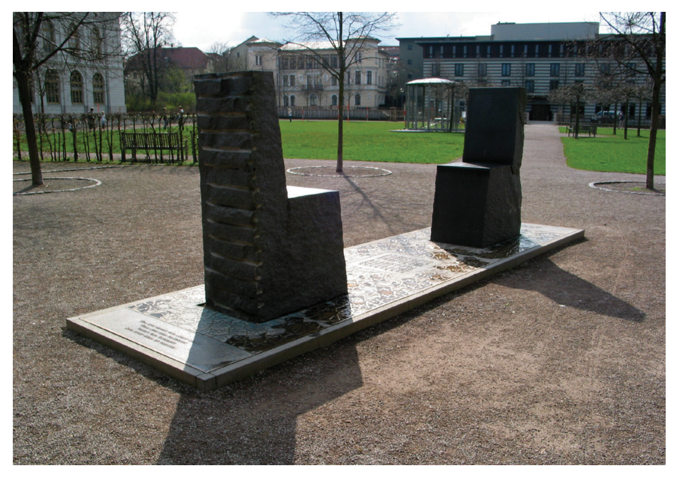
Hafez-Goethe Monument, Weimer, Germany