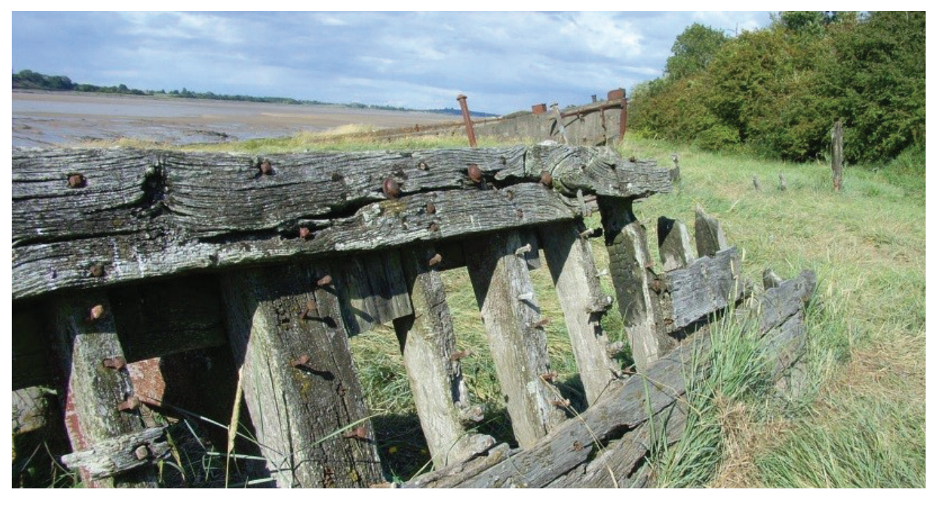
Purton Hulks, River Severn, Gloucestershire. The Purton Hulks are the decayed remains of abandoned boats and ships, deliberately beached in the 1950s to reinforce the banks of the Severn and now interwoven with the landscape. Many of the vessels, including the Severn Collier pictured, were used to transport commodities such as coal along the river and surrounding waterways.