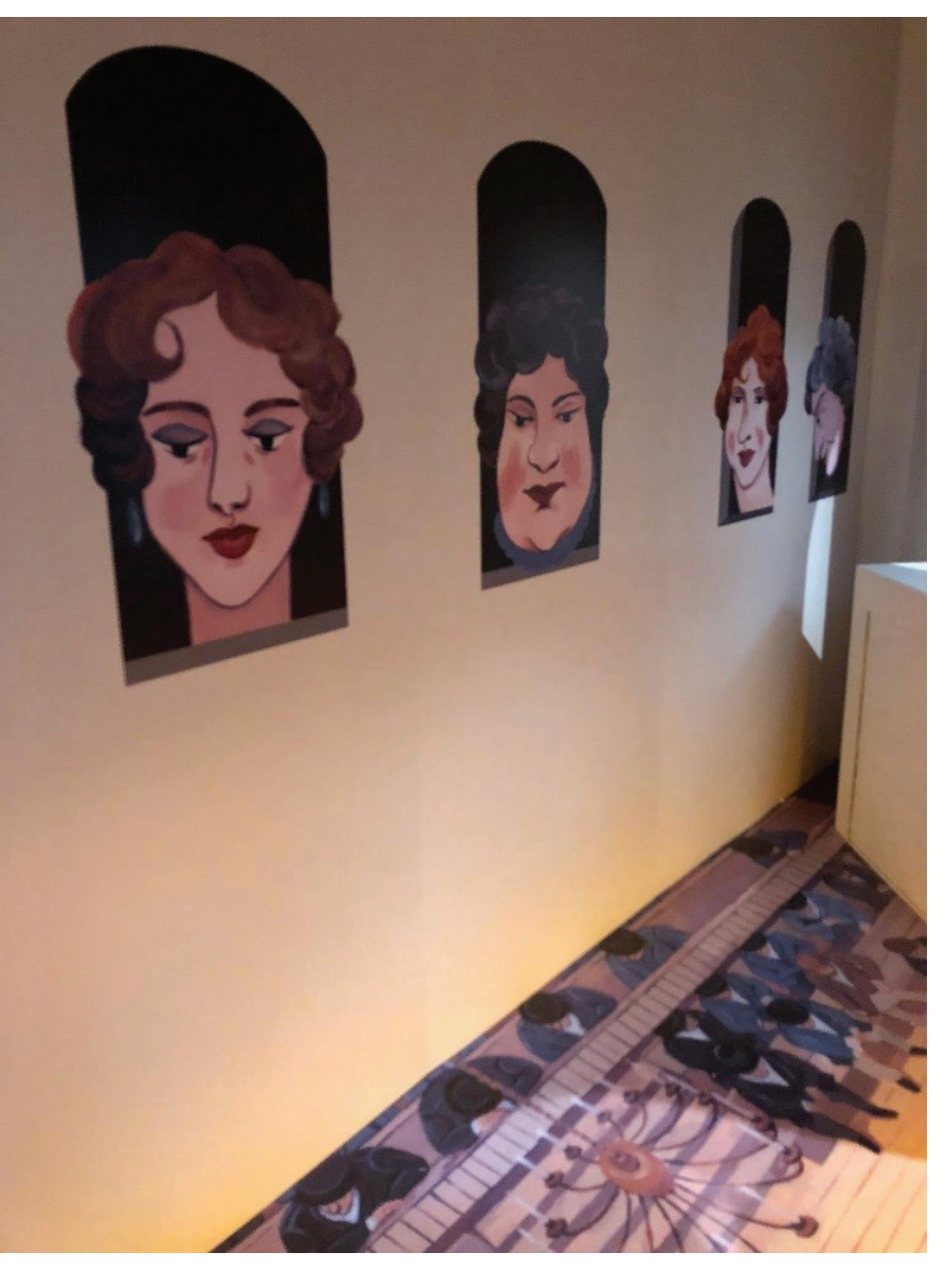
A model of the Ventilator space in the pre-1834 House of Commons where women peeped through a grating from an attic space above the chamber to listen to debates

https://www.parliament.uk/get-involved/vote-100/voiceand-vote/