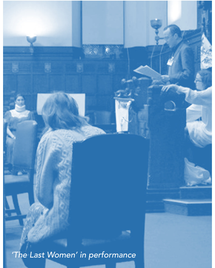
'The Last Women' in performance

'The Last Women' is being developed through seven linked, thematic modules, utilising the Immersive Museum Theatre technique. For each module an immersive space is set up in which participants engage with each other and with objects, documents and other artefacts relevant to the module theme. Participants include professional actors, specialists, and people from the community. On separate occasions members of the public will 'witness' the developing activity as audience members, but will