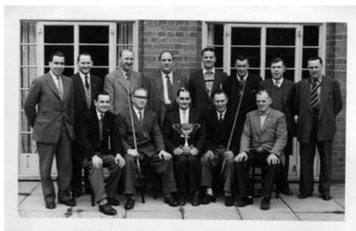
Winning Canley Club Team - Date Unknown My father is seated centre holding cup

My research has also included archive work, not only in Coventry but also at the Club and Institute Union headquarters in London. I have gone through about 60 years of their monthly journals which has been not just an academic exercise but something more personal as I found many old faces there. I focussed my search on clubs in Coventry as this city had a reputation in the post-war era of being the 'queen of club cities.' I uncovered a mine of information in the club journals which has been added to my growing bank of data.