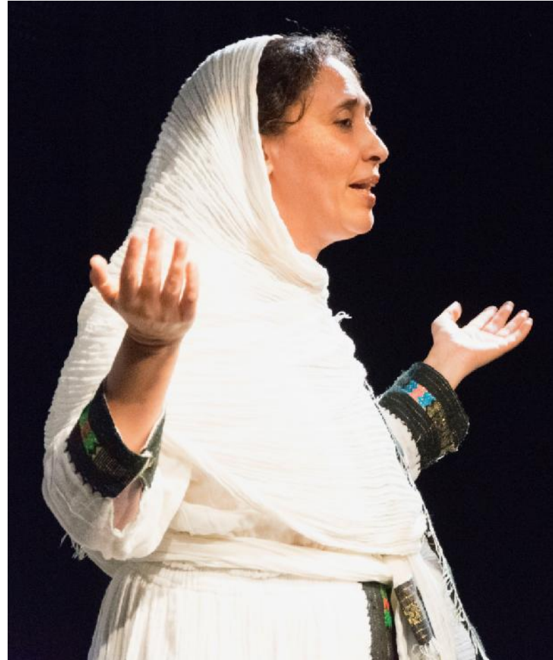
University of Warwick, 4 March 2016