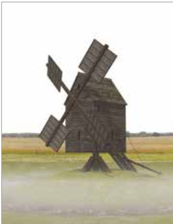
Right and top right: reconstruction by the 3-d Visualisation Centre

To the north-east of the Farmhouse, a high hill marks not only the highest point of land on Warwick's campus, but also one of the most intriguing stories of the site. The hill has an elongated mound on its crest, consistent with a Bronze Age barrow, or burial mound. Due to the age, soil type, and fairly constant agricultural use of the land for almost a millennium, it is unlikely that there are any remains of the person in whose honour it was raised. The mound, however, was re-used in the late middle ages and by the 16th century a windmill had been raised on the hill. To the very end of Cryfield's days as a farm, that field was known as Mill Hill Field.