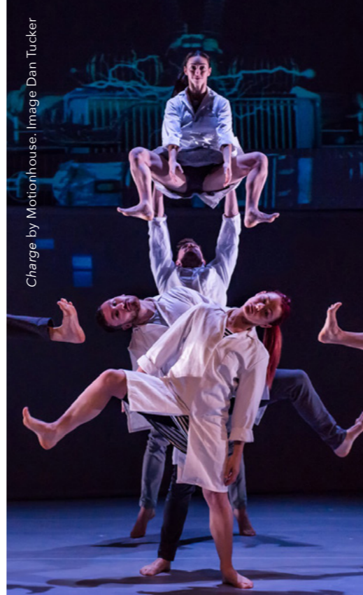
Charge by Motionhouse.

Dramatic Society (WUDS), which produces published plays; Shakespeare Society, which focuses on the works of the Bard; BAME Creatives, which aims to increase the visibility of BAME representation in theatre; Tech Crew, which supports all student productions behind the scenes; the Pantomime Society, which does what it says on the tin (oh yes it does!); and the all-singing, all-dancing Music Theatre Warwick. There's also an abundance of dance, music and arts societies, as well as those geared towards academic subjects, sports, hobbies, nations and cultures.