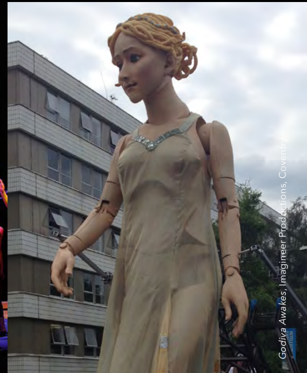
Godiva Awakes, Imagineer Productions, Coventry