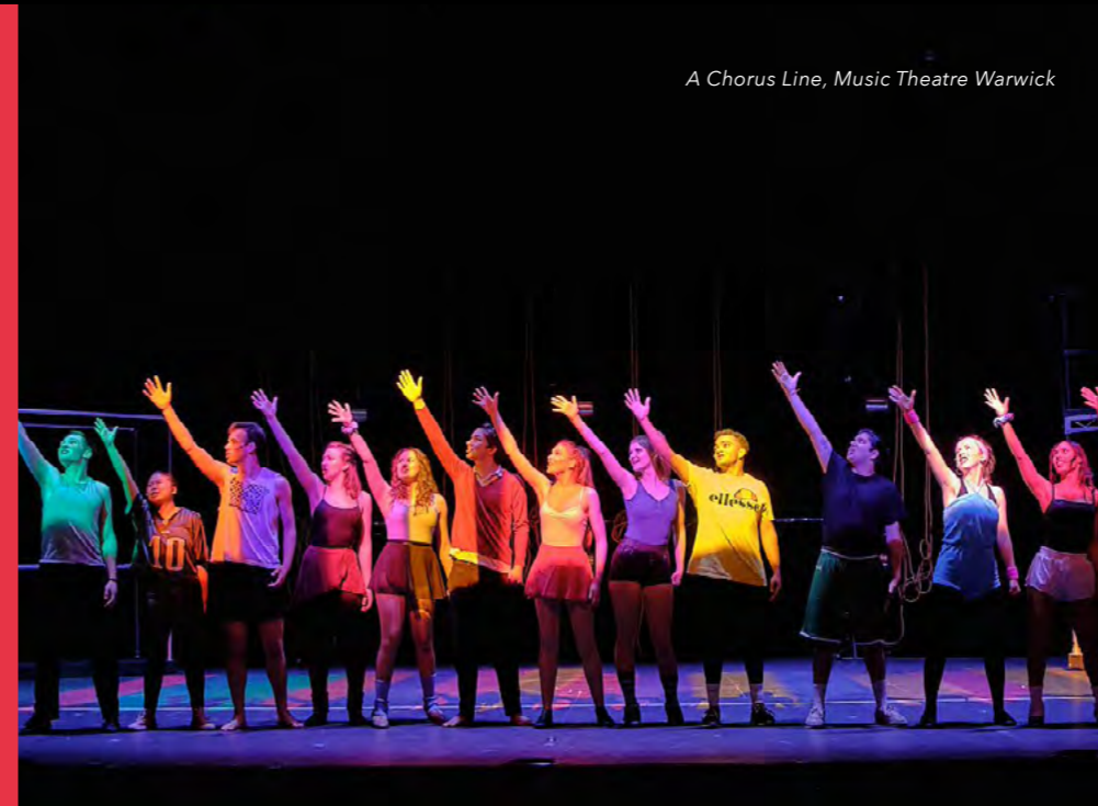
A Chorus Line, Music Theatre Warwick

YOU'LL BE PERFECTLY POSITIONED TO TAKE ADVANTAGE OF THE CITY OF CULTURE'S SIGNIFICANT LEGACY