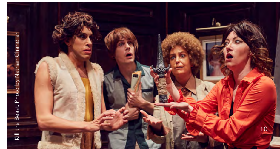
Kill the Beast, Photo by Nathan Chandler