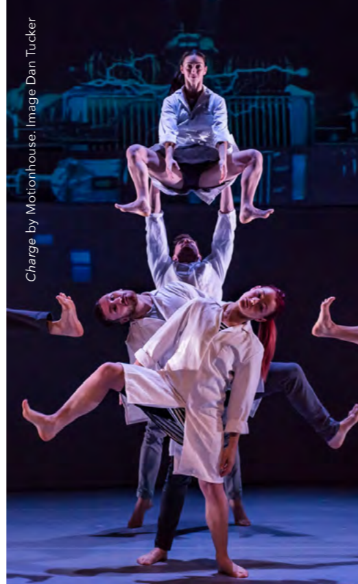
Charge by Motionhouse.

Dramatic Society (WUDS), which produces published plays; Shakespeare Society, which focuses on the works of the Bard; BAME Creatives, which aims to increase the visibility of BAME representation in theatre; Tech Crew, which supports all student productions behind the scenes; the Pantomime Society, which does what it says on the tin (oh yes it does!); and the all-singing, all-dancing Music Theatre Warwick. There's also an abundance of dance, music and arts societies, as well as those geared towards academic subjects, sports, hobbies, nations and cultures.