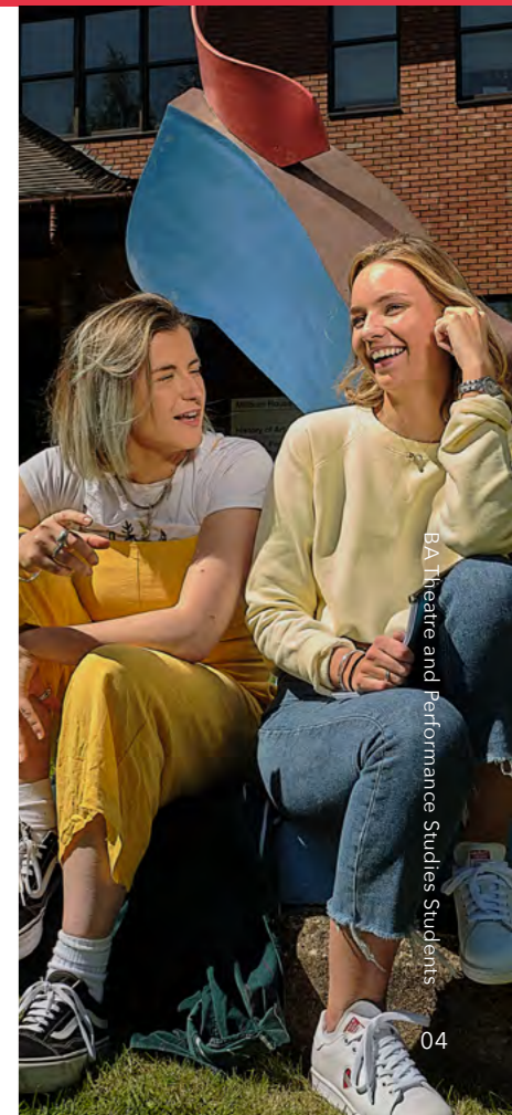
BA Theatre and Performance Studies Students

From the outset you'll be given individual support from a second- or third-year student mentor and from a member of academic staff who will act as your Personal Tutor for the duration of your time at Warwick. Your Personal Tutor will arrange regular meetings with you to discuss topics such as academic progress, career planning, and your wellbeing. There are also central services - including Wellbeing Support, Disability Services, the Residential Life Team and Student Opportunity, which can give you specialist advice and guidance during your degree.