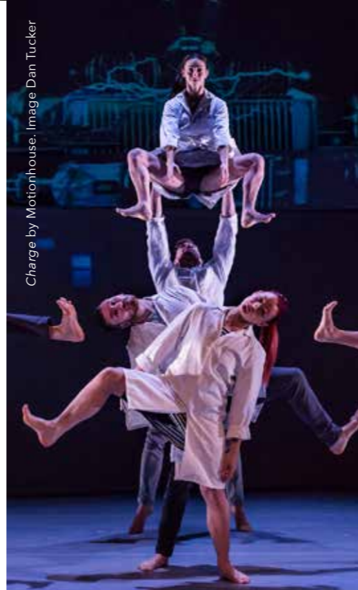
Charge by Motionhouse

specialises in devised work and adaptation; the Warwick University Dramatic Society (WUDS), which produces published plays; Shakespeare Society, which focuses on the works of the Bard; the Pantomime Society, which does what it says on the tin (oh yes it does!); and the all-singing, all-dancing Music Theatre Warwick. There's also an abundance of dance, music and arts societies, as well as those geared towards academic subjects, sports, hobbies, nations and cultures.