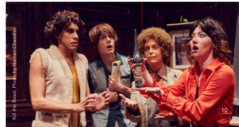
Kill the Beast