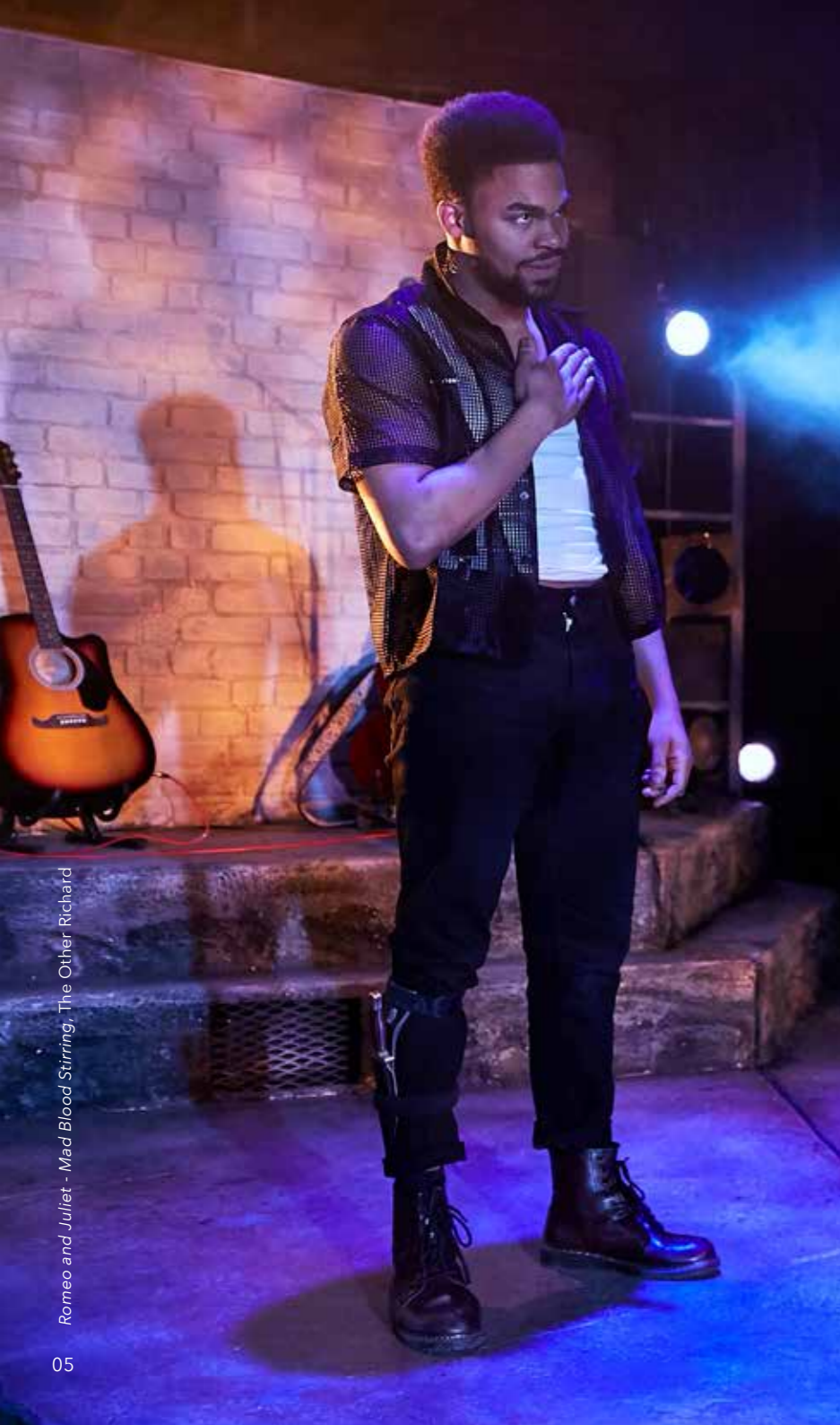
Romeo and Juliet - Mad Blood Stirring