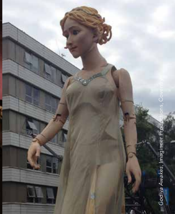
Godiva Awakes, Imagineer Productions, Coventry