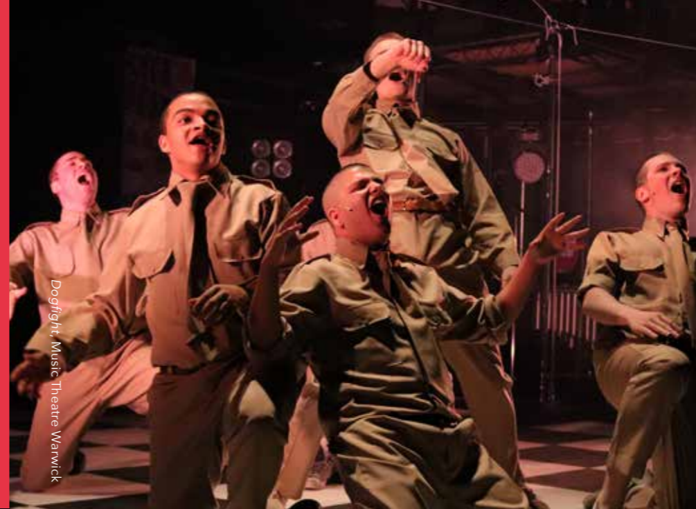
Dogfight, Music Theatre Warwick

YOU'LL BE PERFECTLY POSITIONED TO TAKE ADVANTAGE OF THE HUGE SURGE OF CULTURAL ACTIVITY ON YOUR DOORSTEP