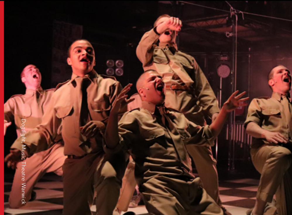
Dogfight, Music Theatre Warwick

YOU'LL BE PERFECTLY POSITIONED TO TAKE ADVANTAGE OF THE CITY OF CULTURE'S SIGNIFICANT LEGACY