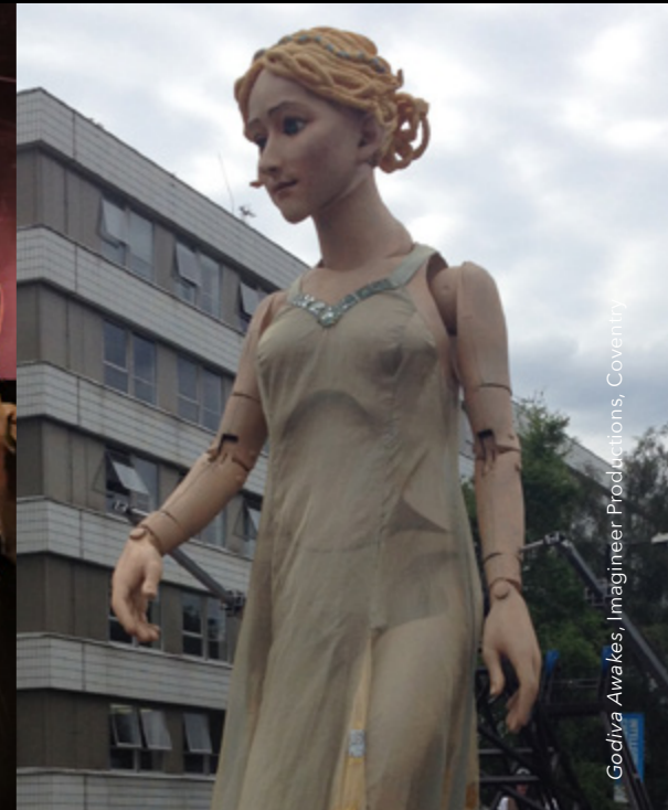
Godiva Awakes, Imagineer Productions, Coventry