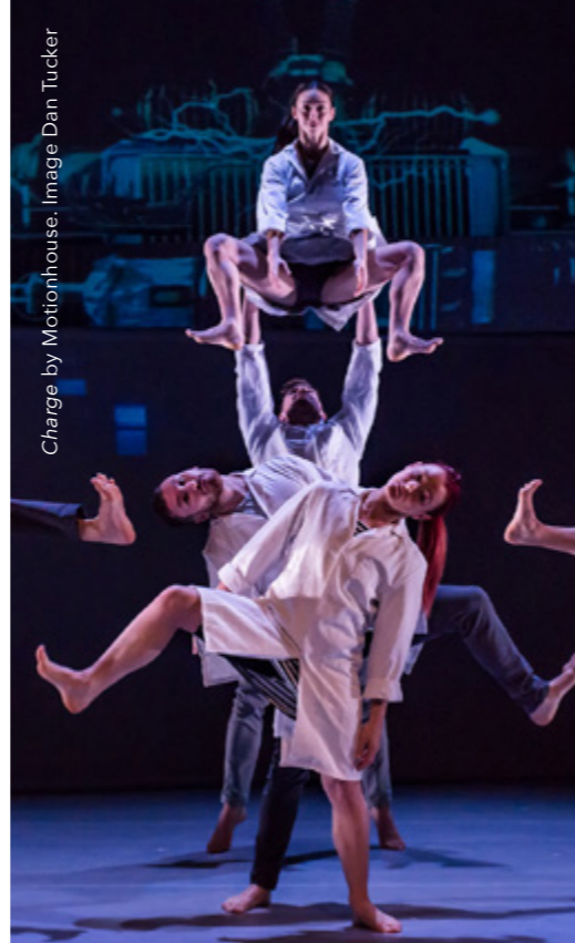
Charge by Motionhouse.

Dramatic Society (WUDS), which produces published plays; Shakespeare Society, which focuses on the works of the Bard; BAME Creatives, which aims to increase the visibility of BAME representation in theatre; Tech Crew, which supports all student productions behind the scenes; the Pantomime Society, which does what it says on the tin (oh yes it does!); and the all-singing, all-dancing Music Theatre Warwick. There's also an abundance of dance, music and arts societies, as well as those geared towards academic subjects, sports, hobbies, nations and cultures.