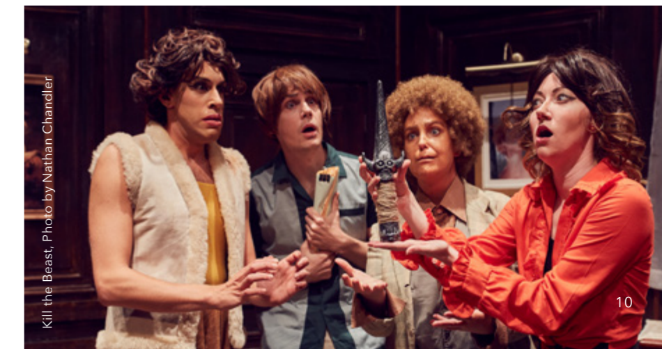
Kill the Beast