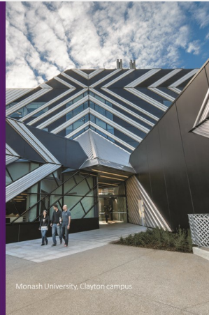
Monash University, Clayton campus