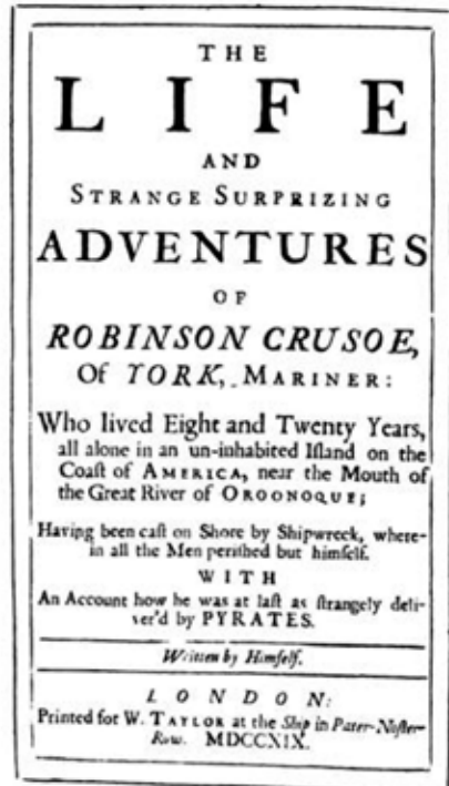
Title page of the first edition of Robinson Crusoe

the classical bias of early scholars, who viewed it as an inferior form of literature to the loftier pursuits of poetry. Indeed, many early works, of which Daniel Defoe's Robinson Crusoe (1719) is merely one example, initially presented themselves as histories to their readers, rather than declare themselves to be works of fiction. In subsequent years, novels were even referred to as 'fictitious histories'. However, with developments in aesthetic theory in the 1730s and 1740s, the novel began to emerge as a respectable and valued form of literature.