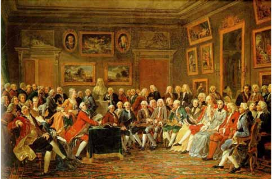
The Salon of Madame Geoffrin

opposition to their participation from some quarters, they actively encouraged women to engage in the process.