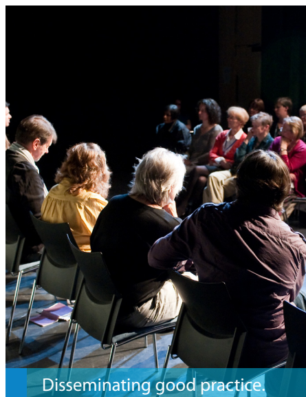
Disseminating good practice.