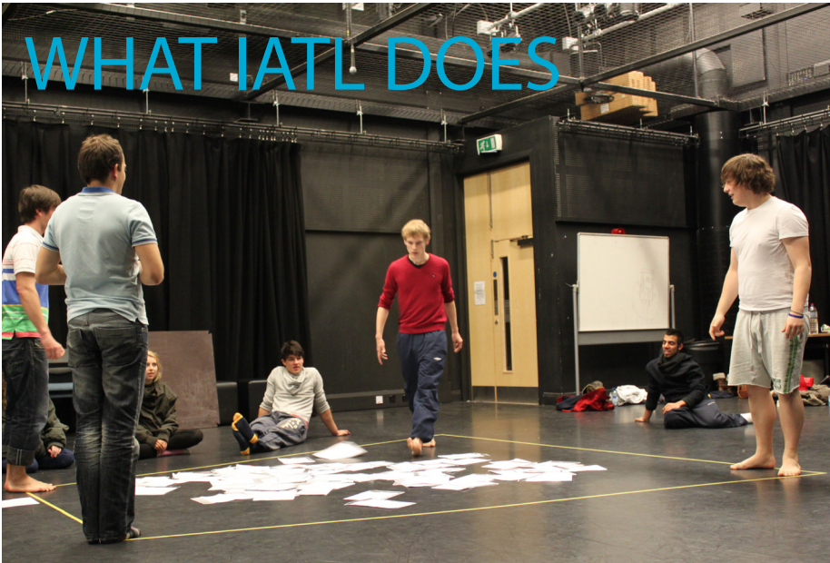
Learning creatively in the IATL spaces.

IATL's aim, in response to the University's 2015 strategy and vision, is to produce 'A Warwick student experience of distinction'. IATL works with departments to embed research-based and practice-based learning in the undergraduate curriculum, to promote the vision of an inclusive academic community where learners, teachers and researchers are all seen as scholars and collaborators in the common pursuit of knowledge, and to foster a pedagogy that enhances creativity and interdisciplinarity, all with an international perspective.