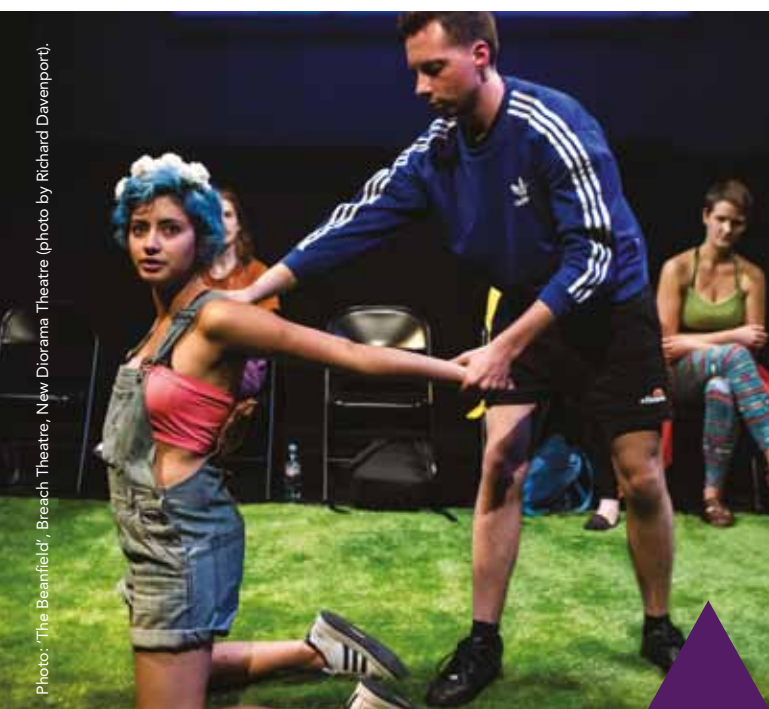
Photo: 'The Beanfield', Breach Theatre, New Diorama Theatre.