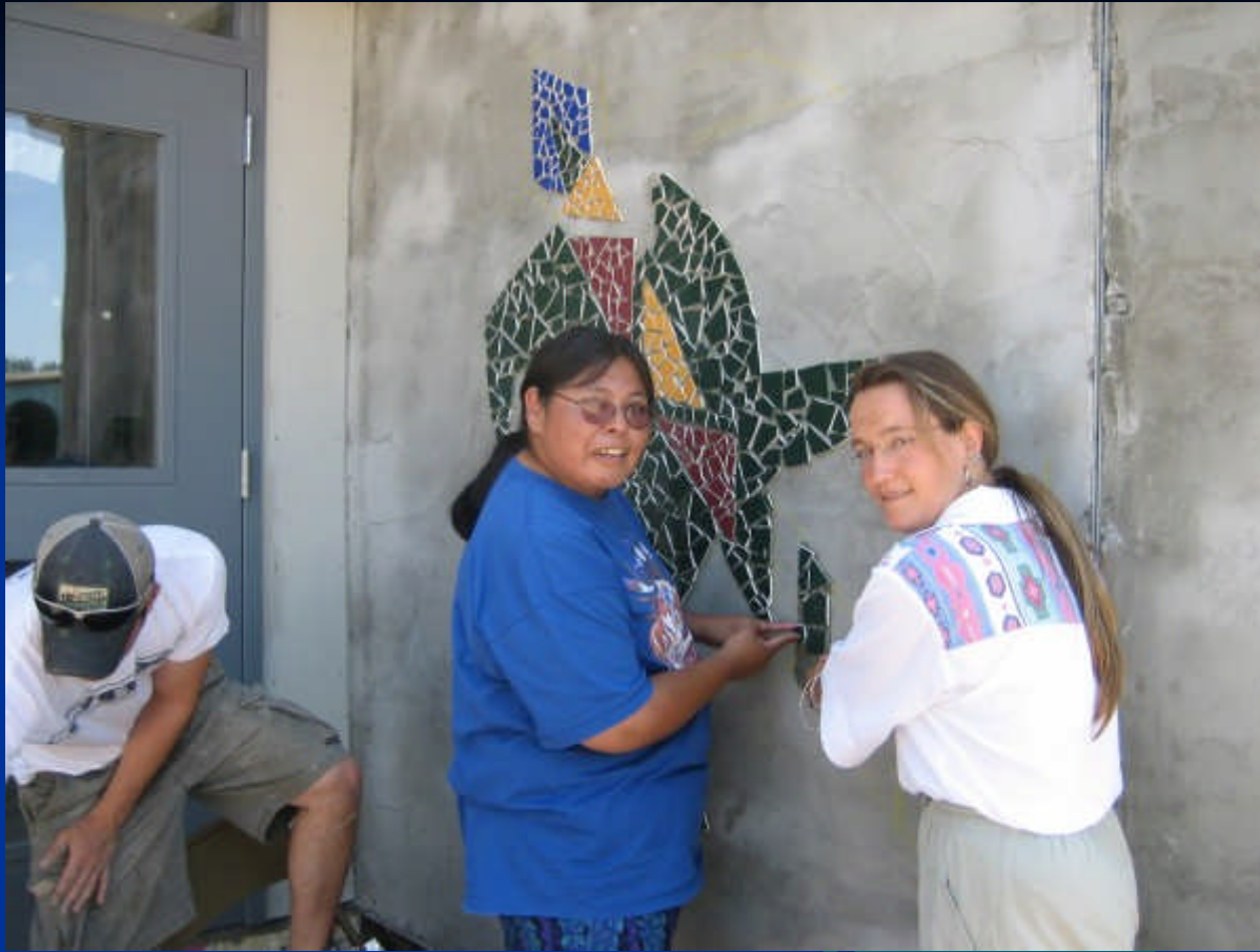
Penn State and Reservation Students working together