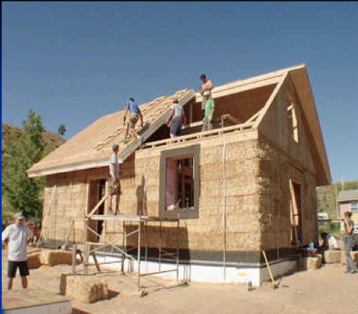
2003 American Indian Housing Initiative on the Northern Cheyenne Reservation, Montana