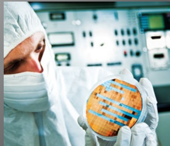
Inspecting semiconductor materials