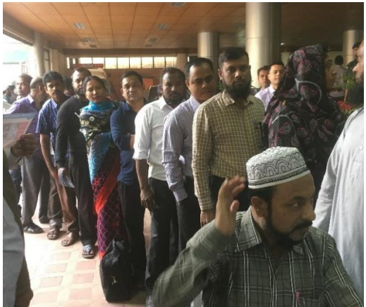
Free hypertension camps were offered.

The National Heart Foundation of Bangladesh (NHFB) is actively working to create awareness circulating awareness messages in Bangla (লবণ ও লবণযুক্ত খাবার কম খান। উচ্চ রক্তচাপ, হৃদররাগ, স্ট্রাক ও ককডনী স্ট্রারগর বুুুুঁ কক কমান – "Avoid salt and processed food and stay free from hypertension, heart attack, brain stroke and kidney diseases" reaching more than 10 million people in Bangladesh, in collaboration with Telenor Health.