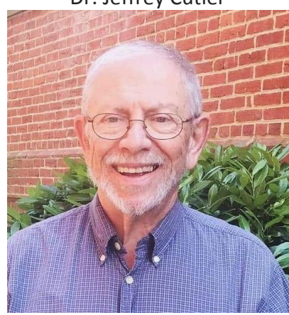
Detlev Ganten Excellence Award in Hypertension and Global Health Implementation —