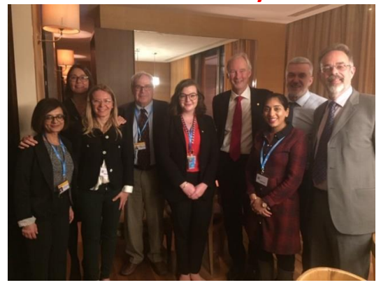
Coalition for Circulatory Health members meet during WHA in Geneva, May 22-28, 2019.