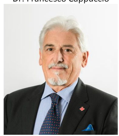
WHL Recognition of Excellence Award in Clinical Hypertension Research -