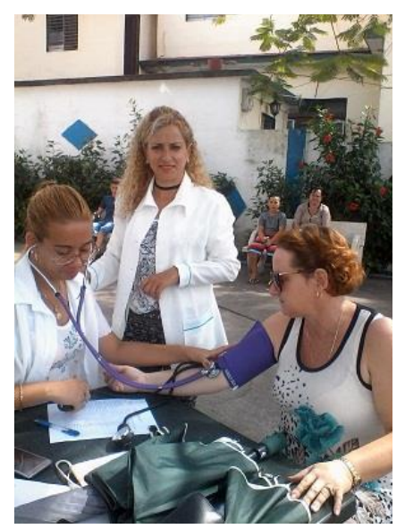
Over 2000 blood pressure screenings took place on World Hypertension at Hospital Clinico Quirurgico branches throughout Cuba.