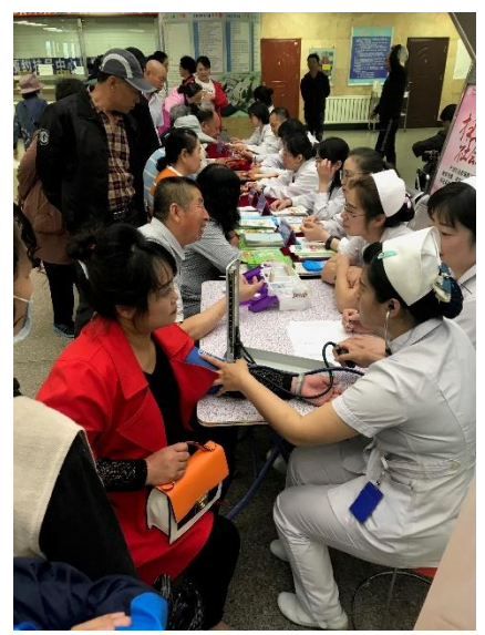
Jilin, China celebrates World Hypertension Day with awareness outreach through Hypertension Clinics.