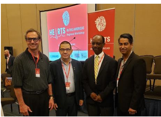
Faculty and Staff at the Joint meeting of the Inter-American Society of Cardiology and PAHO, during the HEARTS Regional Workshop, May 14-17, 2019 in the Dominican Republic.