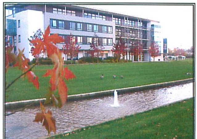
University of Warwick

Kate Seers and Davide Nicolini chaired a day full of international papers covering a range of interventions such as clinics of activity, change laboratories, plus practical examples of change in a variety of organisations.