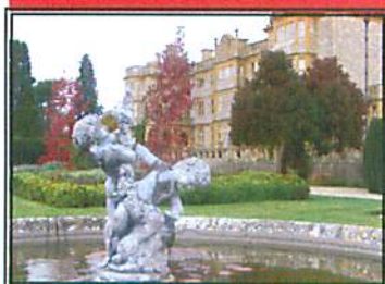
Eynsham Hall, Oxford

“Hope is both the fuel and catalyst for recovery” staff participant