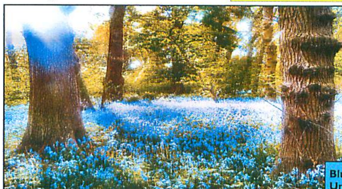
Bluebells in Tocil Wood, University of Warwick

A cross study synthesis matched the evidence with an effectiveness review of falls intervention. The synthesis identified the need to consider patients concerns and to explore further preferences for interventions such as walking, integrated exercise and self management.