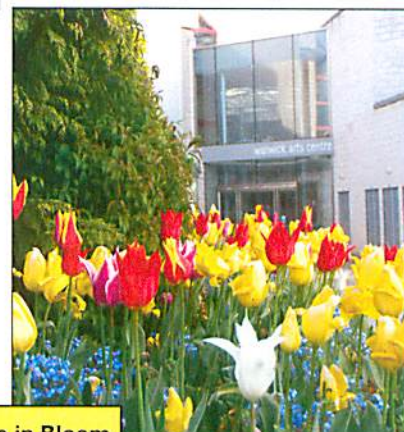
Warwick Arts Centre in Bloom