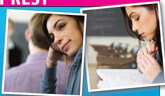
No activity, such as daydreaming

Noninvasive methods, such as positron-emission tomography and functional magnetic resonance imaging, did not initially capture signs of background activity in the brain when a subject was doing nothing and so provided an inaccurate picture of neural activity.