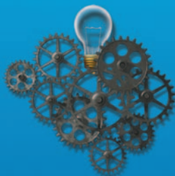
No activity in brain

Brain scans originally seemed to suggest that most neurons were quiet until needed for some activity, such as reading, at which point the brain fired up and expended energy on the signaling needed for the task.