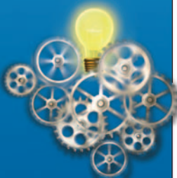
Higher activity in brain