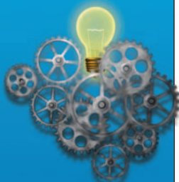
High activity in brain