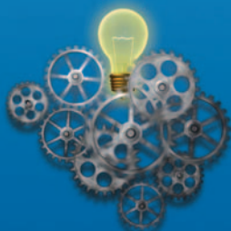
High activity in brain

In recent years additional neuroimaging experiments have shown that the brain maintains a high level of activity even when nominally “at rest.” In fact, reading or other routine tasks require minimal additional energy, no more than a 5 percent increment, over what is already being consumed when in this highly active baseline state.