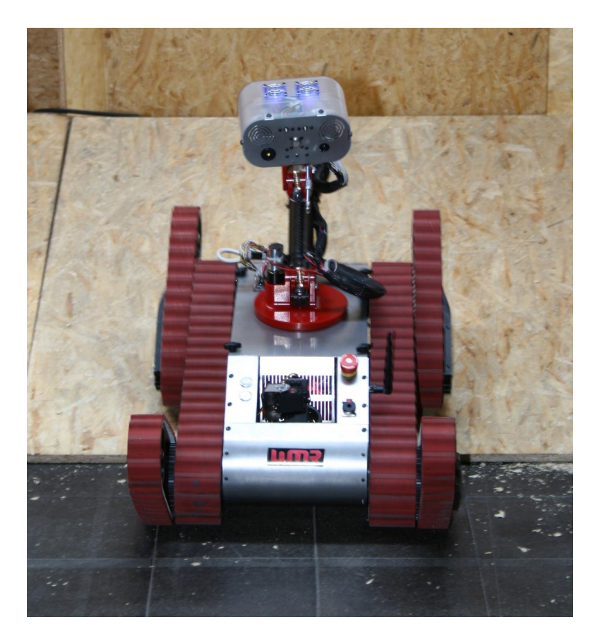
Figure 2 - Tele-operated robot

The tele-operated robot is designed for the sections of the competition that require good maneuverability over uneven terrain and steep slopes. In the previous year, our robot won best in class for mobility in the European open and so much of the mechanical systems remained the same. Instead we focused on reducing the weight of the robot to obtain longer run times with the optimum battery configuration and to aid in ascending the steeper slopes. We also installed new, more suitable motors to ensure optimum use of the tracks and flippers. Using large tracks and flippers it can negotiate obstacles to locate victims under the operation of a controller from a wireless position with no direct visibility of the robot. Every component has been modeled in Solidworks. This is essential for establishing the optimum configuration of parts, from the positioning of electrical components and wires to the ideal fan cooling arrangement. It is also necessary for creating the CAD files used directly in the laser cutting process. An image of the tele-operated robot can be seen in Figure 2.