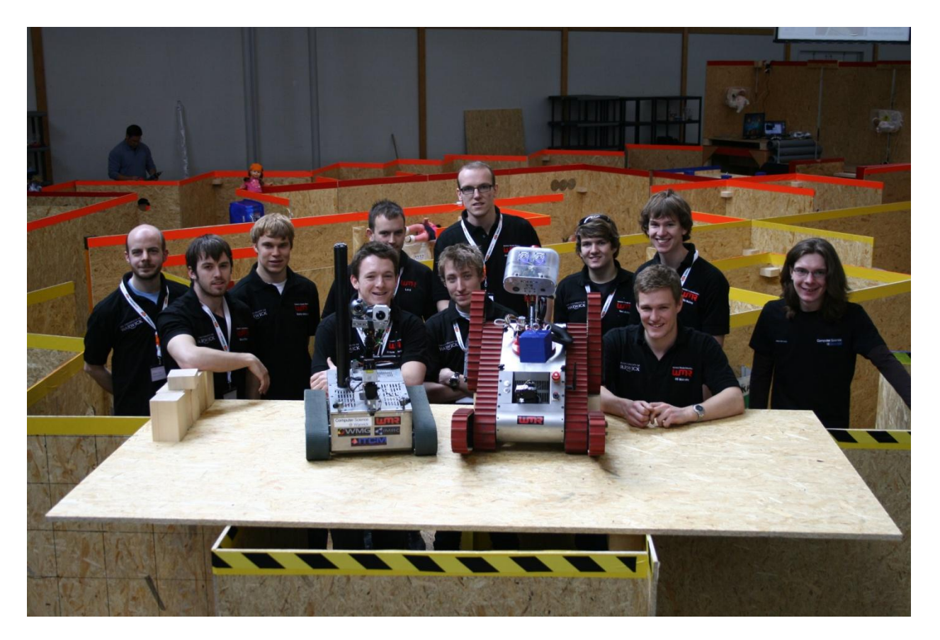
Figure 5 - WMR team 2010

The 2009/10 WMR team won the 2010 RoboCup Rescue European Championships, using both their teleoperated and autonomous robots (Figure 5).