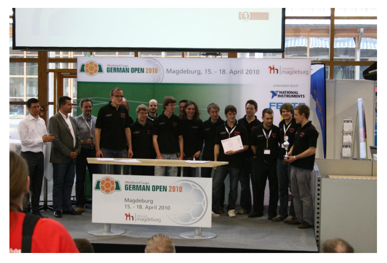
Figure 6 - 1st place RoboCup Rescue European Championship