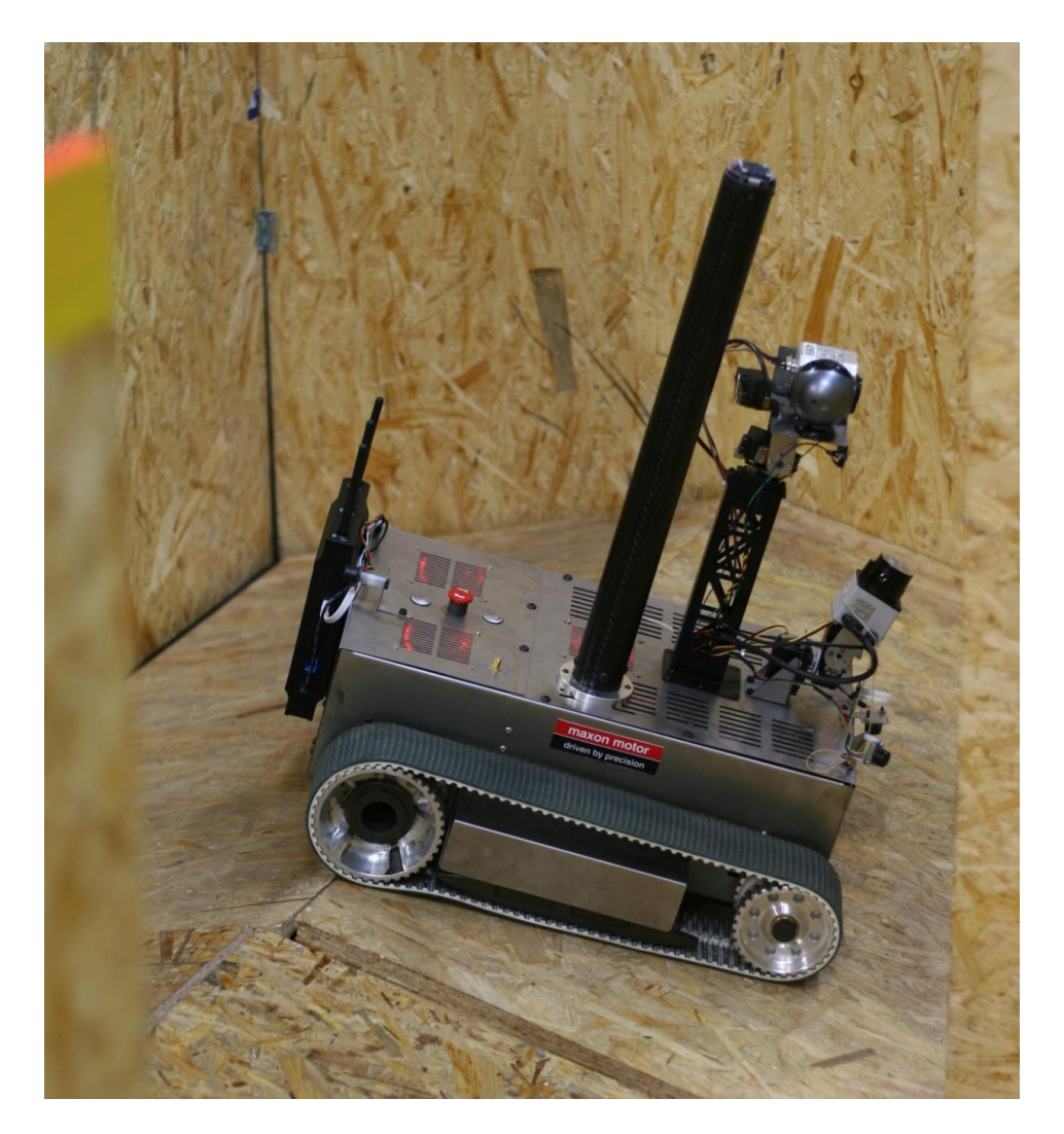
Figure 3 - Autonomous robot

During the initial stages of the project, a decision was made by the team to enter two robots, each specifically designed to meet the requirements of the zones in which they will compete. This meant designing and manufacturing an entirely new robot capable of self-navigation, mapping and indentifying the state and location of victims. In order to reduce the magnitude of the task, the robot was designed to use many of the existing spare components available to the team. In addition, the software design was largely outsourced to a team of Warwick University Computer Science students. An image of the autonomous robot can be seen in Figure 3.