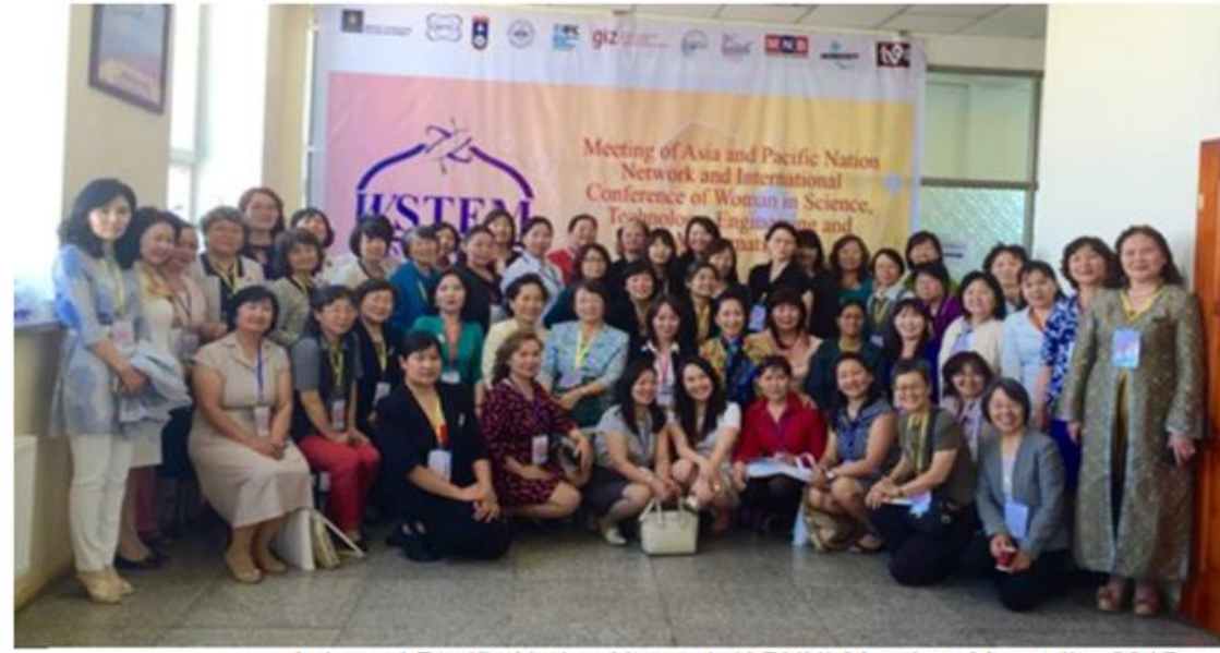
Asia and Pacific Nation Network (APNN) Meeting, Mongolia, 2015

Asia and Pacific Nation Network (APNN) Meeting, Wellington, 2016