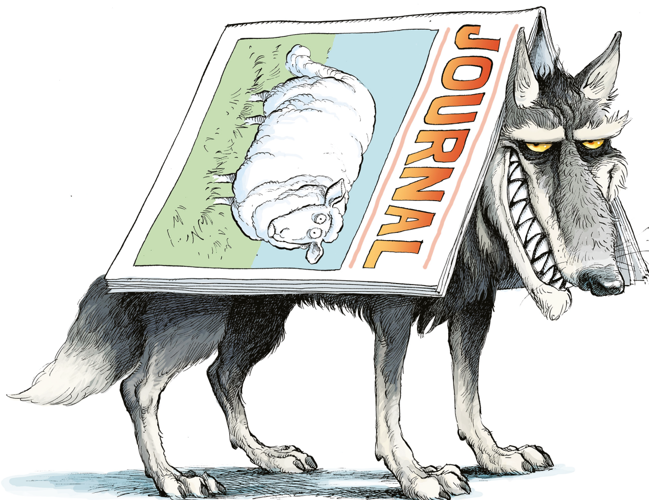
ILLUSTRATION BY DAVID PARKINS