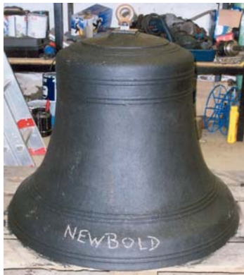
Newbold on Avon Complete

'E' Restore or repair buildings for religious worship, or of architectural or historical interest