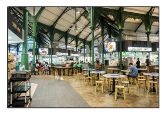
2 Lau Pa Sat Hawker Centre

for a meal and there is an amazing variety of cuisines including Chinese, Malaysian, Indian, Japanese, Korean, and Indonesian. There are also Western stalls which sell pasta dishes, chicken and chips, and lamb chops along with other dishes however they are not as good as the other stalls in my opinion. The canteens close at around half 8, 9 o'clock so if you want food later, I recommend going to the 7-Eleven on campus and getting a ready meal. Food off campus is a little more expensive if you go to hawker centres, and a lot more expensive if you eat out. Hawker centres are a lot like the university canteens with small stalls selling