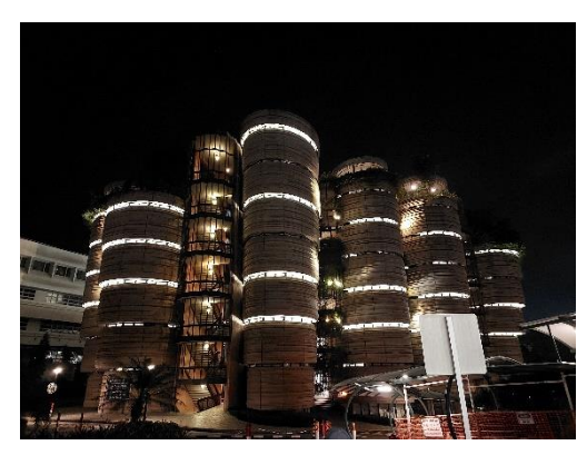
4 An NTU building called the Hive

The NTU campus is very beautiful and has lots of study spaces if you don't want to study in your room. Everywhere on campus is walkable (albeit up and down hills) but there are also two free buses that circle campus in opposite directions and a third one which goes from Pioneer station to the centre of campus.