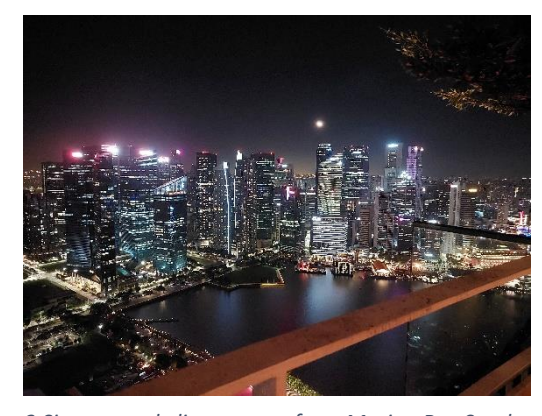
{\it 3 Singapore skyline as seen from Marina Bay Sands}\\

There are lots of cool places to see in Singapore. My friend and I took a boat over to Palau Ubin and saw some amazing wildlife including wild boars, monkeys, and monitor lizards. We went to the artificial beaches on Sentosa island a few times. It's easy to get there: just take the green line to Buona Vista then the yellow line to Harbourfront where you can get the Sentosa express monorail. Another friend and I went to the Halloween Horror nights at Universal also on Sentosa. It's the same price as regular tickets if you get it on a Thursday! I would recommend just inviting people in the group chat to go with you to places in the first couple of weeks, there's sure to be people who are interested.