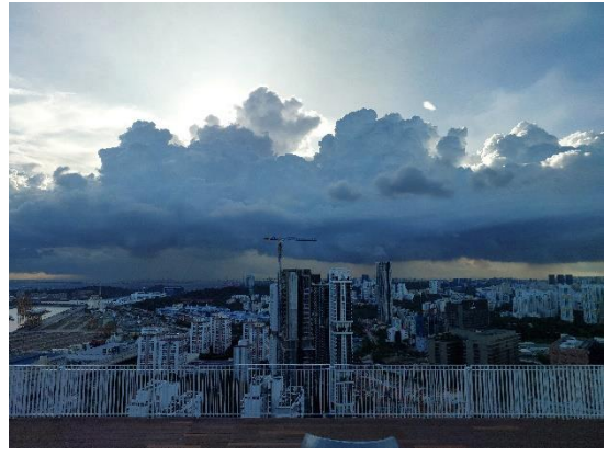
1 East Singapore with a storm cloud overhead

malls, stations and classrooms in the university. The rain is also very heavy and often will flood some areas on campus. I found it better to just wear sliders sometimes and get my feet wet rather than trying to keep my socks and shoes dry. Most of the time when it rains it's also stormy; open areas have sirens that go off during the storms telling you to get under shelter and there were several times when I was woken up in the middle of the night to lightning hitting my halls. I found the storms to be very beautiful however, especially when you can see them in the distance.