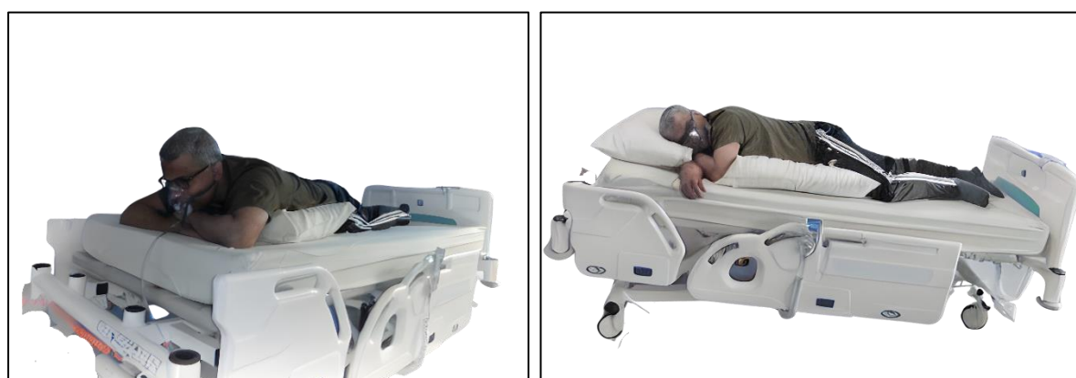
Figure 2: Images of full-prone and 3/4 prone position

We carefully considered the optimum daily target for awake prone positioning, noting that in observational studies a treatment duration of 6-8 hours/ day seems to be a key cut-off for treatment efficacy. 25 26 However, the recent systematic review and meta-analysis of awake prone positioning in COVID-19 found no evidence of an interaction in a sub-group analysis of treatment duration. 24 The large meta-trial of awake prone positioning in COVID-